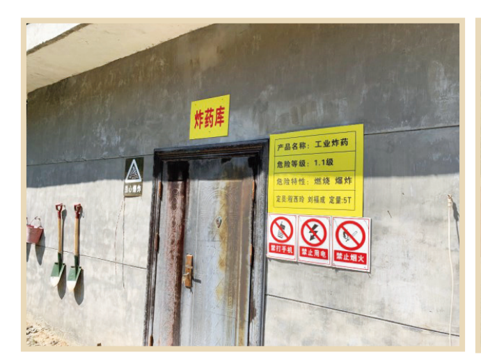
Safety facility outside warehouse storing detonators 炸藥庫外的安全設備

貴集團使用炸藥開採金礦物,並嚴格遵 守與中國標準貫徹一致的炸藥使用規則 及法規。 貴集團設有經安全機構及控 制物資的地方公安機關批准並根據其規 定標準設計的專門、專用及隔離的炸藥 庫。雷管及炸藥存放於兩個獨立的庫 内,彼此之間存有安全距離。該等庫房 所在的院落完全被高牆、金屬門及24 小時監控攝像頭護衛。兩間炸藥庫均各 有兩把鎖、鎖匙由兩名獨立僱員(一名 管理人員及一名安全人員)保管。僅於 該兩名人員(鎖匙保管人)同時出現方能 完全打開全部門鎖,方可取得雷管及/ 或炸藥。存儲設施由管理層以及安全及 公安機關定期檢查,以確保始終合規。 使用炸藥後, 貴集團將使用檢測設備 測量空氣殘餘物數量,待空氣符合標準 後方會安排僱員進入金礦。