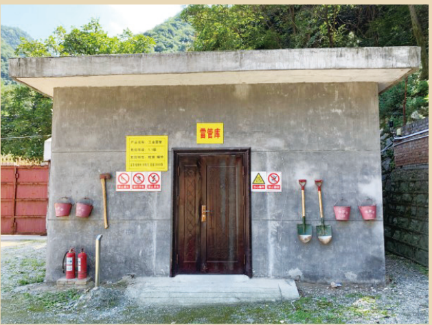
Safety facility outside explosive storage 雷管庫外的安全設備