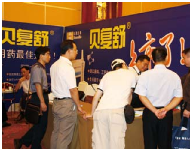
The tenth national conference on corneal diseases and ocular surface diseases held in Xiamen, the PRC in October 2008.