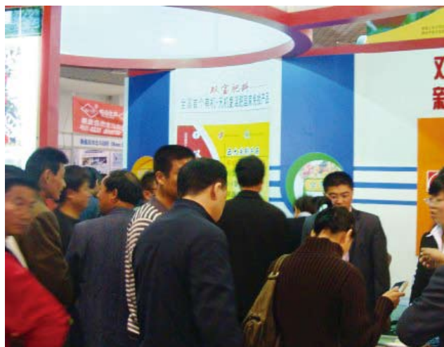
The ninth high-concentration phosphate compound fertilizer trade fair of the PRC.