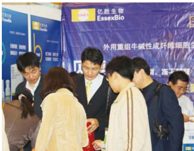
The national conference on burns held in Hunan, the PRC in November 2008.

In respect of the Group's agricultural fertilizers business, the Group is primarily focusing on penetrating the market in Shandong province and has expanded into Hebei province for the year under review. It adopted two pronged marketing development strategies: (i) servicing major customers directly and (ii) servicing through distributors to reach out to smaller customers. Currently, the Group's agricultural fertilizers are specially formulated for the cultivations of fruits, ground nuts, corns and leafy veggies.