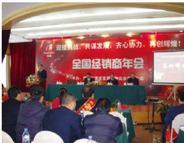
2008 annual conference of nationwide dealers in Baoyuan, Yantai, the PRC