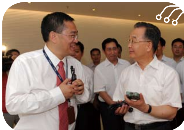
Wen Jiabao, Premier of the State Council, visited EVOC

EVOC Intelligent Technology Company Limited was established in the People's Republic of China (the "PRC") on 18 December 2000 as a joint stock limited company under the PRC's Company Law. The Company's H shares were listed on the GEM of the Stock Exchange of Hong Kong on 10 October 2003 (the "Listing"). The Company and its subsidiary ("Group") are principally engaged in the research, development, manufacture and distribution of advanced process automation (APA) products. As at 31 December 2008, the registered capital of the company amounted to approximately RMB123.3 million with the Group's total assets to approximately RMB2.8 billion.