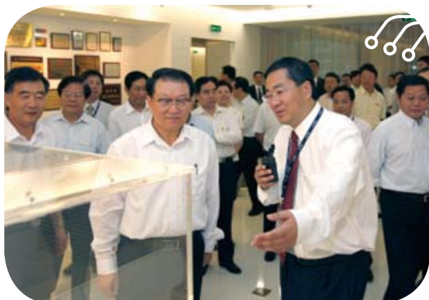
Li Changchun, a member of the Politburo Standing Committee of the CPC Central Committee, visited EVOC

The Group is one of the leading domestic manufacturers of APA products in the PRC. APA is a computer system allowing users to adapt hardware and software applications to perform a dedicated function or a range of dedicated functions such as data processing, generating, interpreting and executing control signals, etc. and is embedded into a product, device or a larger system. APA products manufactured and distributed by the Group are widely applied in, among other, telecommunication, industrial, military, electricity generation, video frequency control, transportation, Internet, commerce and finance industries. The Group offers over 380 APA products, which can be broadly classified by their distinctive functions and features into three categories, chassis-type APA products, board-type APA products and remote data modules.