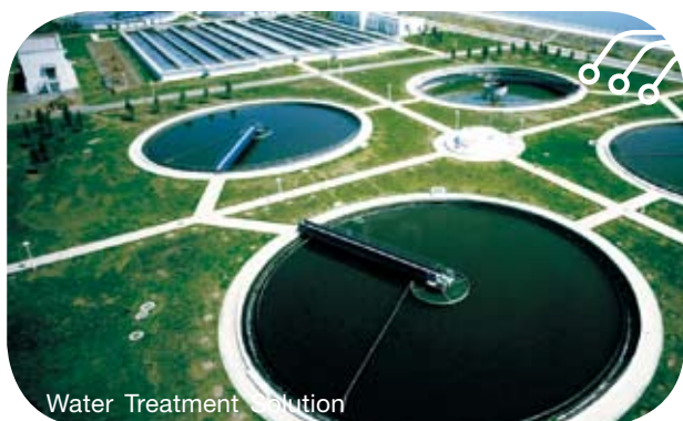
Water Treatment Solution

Rapid development of information technology in China and traditional industries in the Country such as utility industries like energy, railway transportation and environment assessment seeking to upgrade their operations have presented APA products a wider market. In this aspect, the Group has offerings that meet the country's