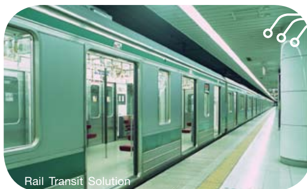
Rail Transit Solution