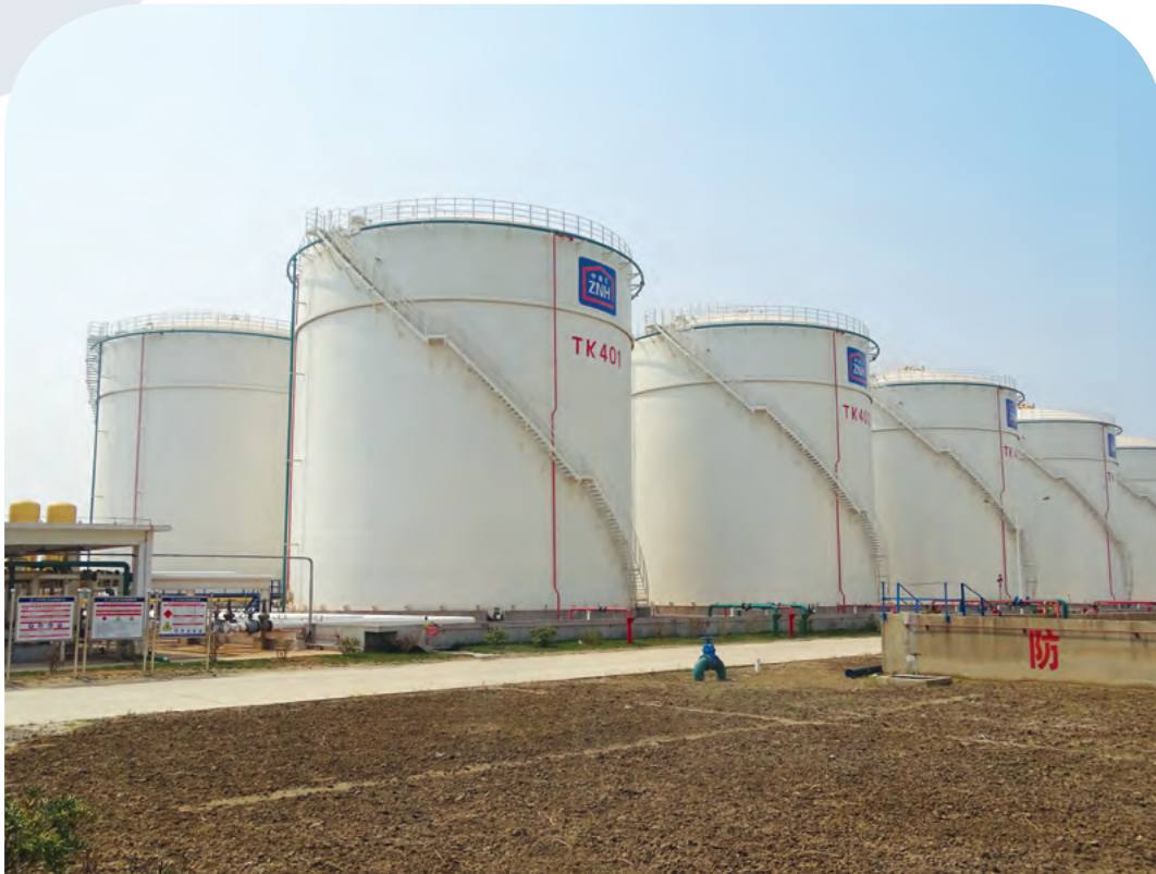
Photo: on-site photo of the oil vapor recovery unit of Zhongnanhui 圖：中南匯油氣回收裝置現場照片