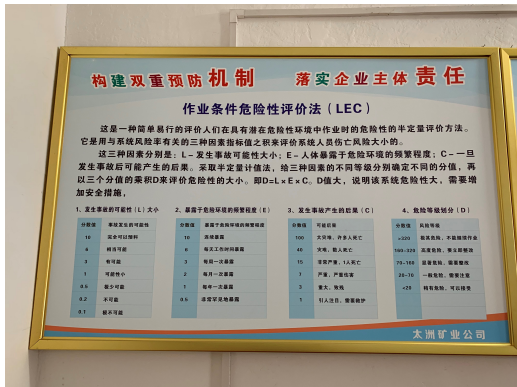
Method of Risk Assessment for Operation Conditions in Mines

The Group has equipped its factory and head office with all the required safety equipment and facilities, and has passed all the governmental safety inspections.