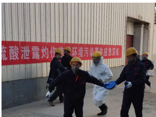
Emergency drill of chemical leakage (Picture 3)