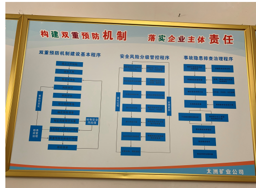
Procedures on Accident Prevention, Safety Risk Classification and the Screening, Identification and Control of Potential Hazards in Mines