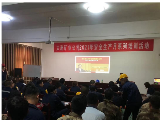
Production safety training activities (Picture 1)

The Group provides various internal trainings for developing the workforce, including orientation and on-board trainings for new staff to enable them to adapt to the operation of the Group efficiently and strengthen their skills and knowledge required for work. It is important for employees to perform tasks safely, follow safety working procedures and operate machines and equipment cautiously.