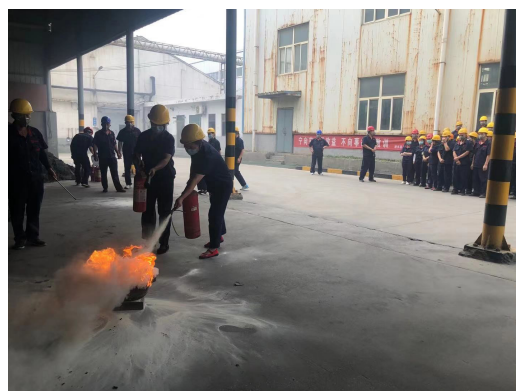
Emergency drill of fire-fighting (Picture 4)

The Group evaluates the training programs from time to time and reviews the effectiveness of training. The Group makes effort to improve employees' knowledge and skills for discharging duties at work.