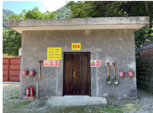
Safety facility outside warehouse storing detonators