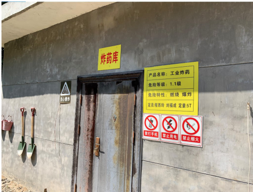
Safety facility outside explosive storage

The Group uses explosives for mining gold and strictly follows rules and regulations on using explosives which are consistent with the standards in the PRC. There are dedicated, exclusive and isolated bunkers designed in accordance with the required standards and approved by safety authority and the local public security authority which controls the supplies. Detonators and explosives are stored in two separate bunkers with a safe distance to each other. The yard to these bunkers is secured with high walls, metal gate, and 24-hour video cameras. Both bunkers are well secured with two locks, with keys kept by two separate staff (one management personnel and one safety personnel). Only when both individuals (key keepers) are present at the same time, all the locks can be unlocked to access detonators and/or explosives. The storage facilities are regularly inspected by the management and the safety and public security authorities to ensure compliance at all time. After the use of explosives, the Group will use detection equipment to measure the residue in the air. Employees cannot be arranged to enter into the gold mine until the air meets the standards.