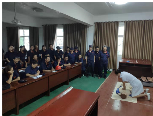
Emergency rescue course (Picture 2)