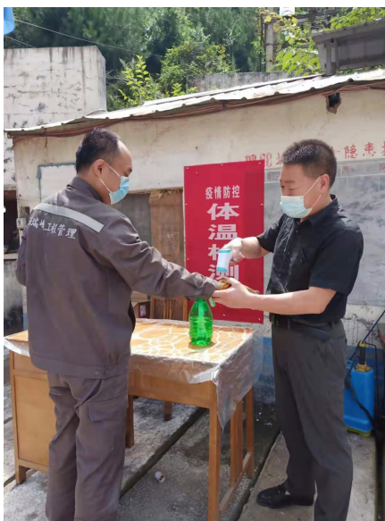
Temperature measurement for employees

During the outbreak of 2019 coronavirus disease (“COVID-19”), in light of various provisions promulgated by the Leadership Group of County Government for Fighting against COVID-19 Epidemic, the Group established its Leadership Group for Fighting against COVID-19 Epidemic. According to the prevention and control principle of “early precaution, early detection, early reporting, early isolation, and early treatment”, the Group strictly implemented its daily control measures. The Group also formulated the Proposal of Tongguan Taizhou Mining Company Limited* (潼關縣太洲礦業有限責任公司) for Fighting against COVID-19 Epidemic and Resumption of Work and Production. The Group strictly adopted a number of precaution measures, including (i) personal health management; (ii) persistent cleaning of office areas, changing rooms and dining areas; (iii) all employees must wear a mask before entering office areas, changing rooms and dining areas; and (iv) all employees are required to have their body temperature checked before entering office areas, changing rooms and dining areas. In addition, the Group also adopted flexible working hours, and reduced unnecessary trips.