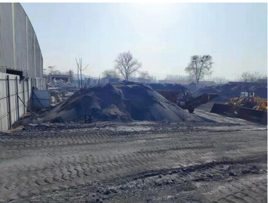
Daily operations of Shandong Kailai