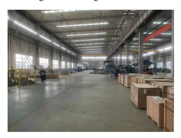
Daily operations of Tengzhou Kaiyuan