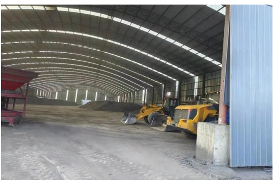
Shandong Kailai's fully-enclosed environmentally friendly storage centre