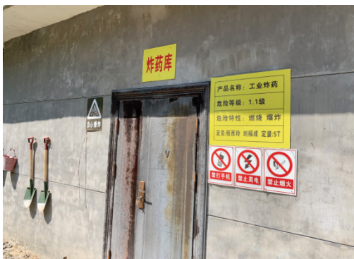
Safety facility outside explosive storage 炸藥庫外的安全設備

本集團使用炸藥開採金礦物，並嚴格遵守與中國標準貫徹一致的炸藥使用規則及法規。本集團設有經安全機構及控制物資的地方公安機關批准並根據其規定標準設計的專門、專用及隔離的炸藥庫。雷管及炸藥存放於兩個獨立的庫內，彼此之間存有安全距離。該等庫房所在的院落完全被高牆、金屬門及24小時監控攝像頭護衛。兩間炸藥庫均各有兩把鎖、鎖匙由兩名獨立僱員（一名管理人員及一名安全人員）保管。僅於該兩名人員（鎖匙保管人）同時出現方能完全打開全部門鎖，才可以取得雷管及／或炸藥。存儲設施由管理層以及安全及公安機關定期檢查，以確保始終合規。使用炸藥後，本集團將使用檢測設備測量空氣殘餘物數量，待空氣符合標準後方會安排僱員進入金礦。