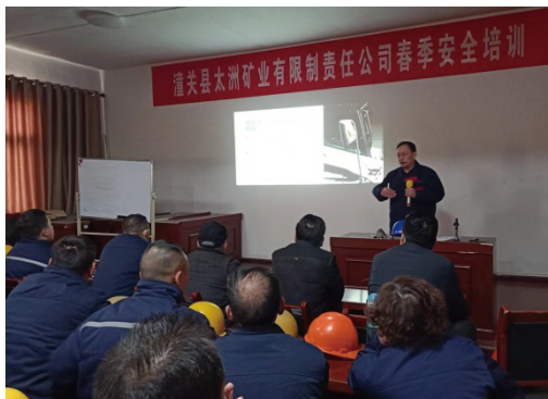
Production safety training activities (Picture 1) 安全生產培訓活動(圖1)

The Group provides various internal trainings for developing the workforce, including orientation and on-board trainings for new employees to enable them to adapt to the operation of the Group efficiently and strengthen their skills and knowledge required for work. It is important for employees to perform tasks safely, follow safety working procedures and operate machines and equipment cautiously.