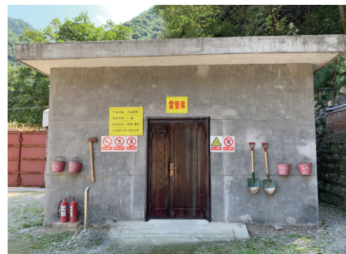
Safety facility outside warehouse storing detonators 雷管庫外的安全設備