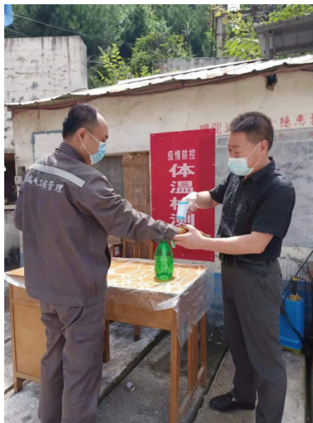
Temperature measurement for employees 僱員體溫測量

2019新冠病毒病爆發期間，本集團針對縣政府應對新冠疫情工作領導小組的各項規定，成立了應對新冠疫情工作領導小組，按照「早預防、早發現、早報告、早隔離、早治療」的防治原則，從嚴日常管控措施，並制定了《潼關縣太洲礦業有限責任公司應對新冠病毒疫情復工復產方案》嚴格採取多項預防政策，包括(i)個人健康管理；(ii)頻繁清潔辦公室區域、更衣室及用膳區域；(iii)所有僱員進入辦公室區、更衣室及用膳域前須戴口罩；及(iv)進入辦公室、更衣室及用膳域區域時測量僱員的體溫。此外，本集團亦安排彈性工作時間，並減少不必要的出行。