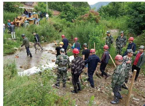
Flood prevention drill (Picture 2) 防汛演練活動(圖2)