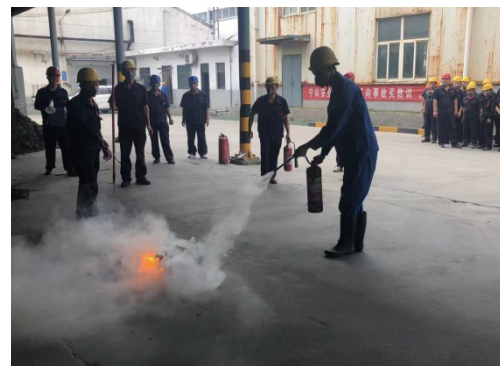
Emergency drill of fire-fighting (Picture 4) 消防應急演練活動(圖4)