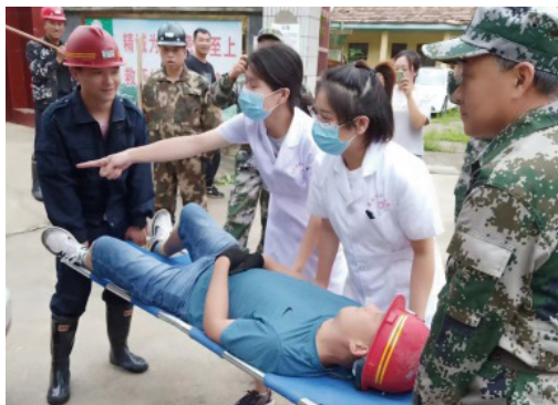
Accident rescue drill (Picture 3) 事故救援演練活動(圖3)