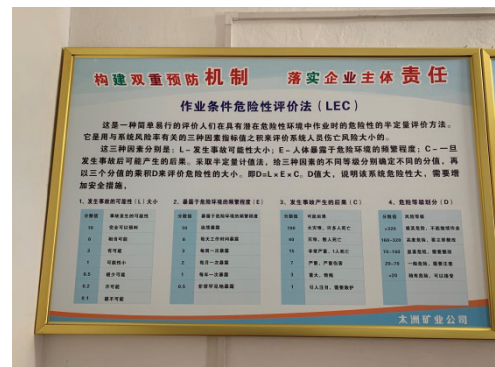
Procedures on Accident Prevention, Safety Risk Classification and the Screening, Identification and Control of Potential Hazards in Mines 於礦山的事務預防、安全風險分級及事故隱患排查治理程序