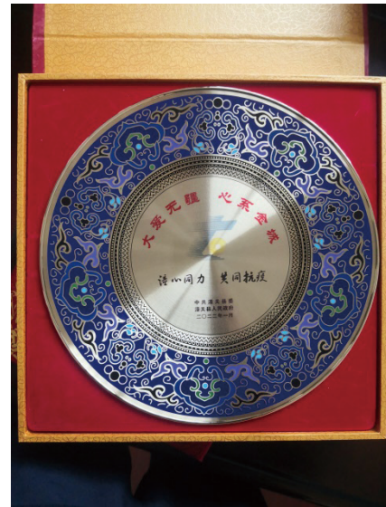
Taizhou Mining has received a donation certificate and monument from Tongguan County People's Government for donating to support epidemic prevention work 於礦山的作業條件太洲礦業因捐款支援防疫工作而獲滄州關縣人民政府贈送捐贈證書及紀念盾危險 評價辦法