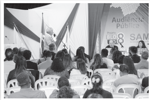
Over a thousand of people has attended the two public hearings regarding the Block 8 Project.

From 18 to 22 July 2022, SUPPRI's technical team made a field technical inspection of the area of the Block 8 project.