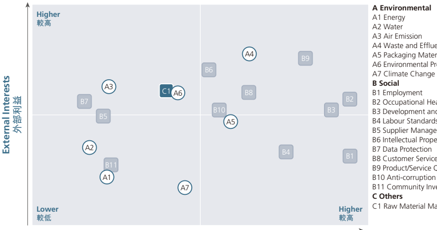
Internal Assessment on Importance to Business 對業務重要性的內部評估

A1 能源 A2 用水 A3 大氣排放物 A4 Waste and Effluent A4 廢棄物和污水 A5 Packaging Material Consumption A5 包裝材料消耗 A6 Environmental Protection Measures A6 環境保護措施 A7 氣候變化 B 社會問題 B1 僱傭 B2 職業健康與安全 B2 Occupational Health and Safety B3 Development and Training B3 發展與培訓 B4 Labour Standards B4 勞工準則 B5 供應鏈管理 B5 Supplier Management B6 Intellectual Property B6 知識產權 B7 數據保護 B8 客戶服務 B9 Product/Service Quality B9 產品/服務質量 B10 反貪污 B11 社區投資 B10 Anti-corruption B11 Community Investment C其他事項 C1 Raw Material Management C1 原材料管理