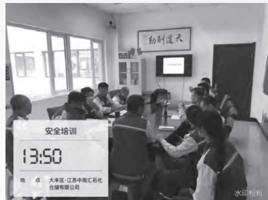
Photo: Dafeng Port Hazardous Waste Disposal Training

二零二二年八月，港儲石化組織員工參加危廢處置知識培訓，通過培訓使員工進一步提升危廢處置技能，加強員工環境保護意識。