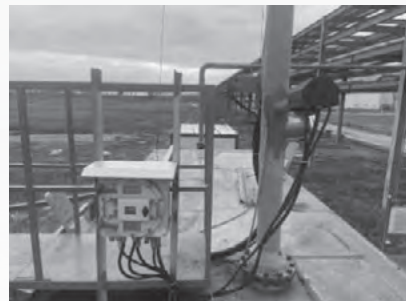
Figure: Online Monitoring System for Oil Vapour Recovery