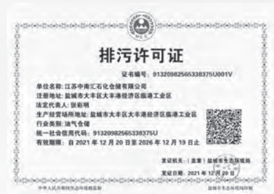
Figure: Photo of pollutant discharge permit 圖：排污許可證照片

公司嚴格遵守《中華人民共和國環境保護法》《中華人民共和國環境影響評價法》《中華人民共和國水污染防治法》《中華人民共和國大氣污染防治法》《中華人民共和國固體廢物污染環境防治法》《中華人民共和國噪聲污染防治法》等國家相關法律法規要求，梳理自身生產運營流程，識別到我們日常運營過程中產生的排放物包括：倉儲洗罐產生的廢水、運營過程中產生的揮發性有機物(VOCs 1 )及固體廢棄物等。為積極控制對周邊生態環境的影響，公司認真貫徹《環境管理制度及措施》《環境保護責任制》等內部管理制度，建立及完善排放物管理相關章程與規範，針對各類型廢棄物制定有《危險廢棄物管理章程》《危險廢物污染防治工作責任制》在內的管理章程，並嚴格執行相應的排放物監管要求。我們根據排污許可證管理要求，定期進行自行監測，定期上報排污季度、年度報告。報告期內，公司未發生違規排放的情況。