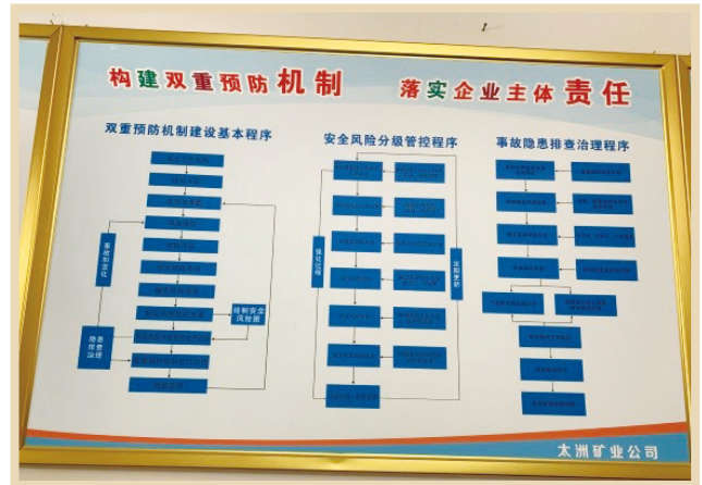
Procedures on Accident Prevention, Safety Risk Classification and the Screening, Identification and Control of Accident Hazards in Mines 於礦山的事故預防、安全風險分級及事故隱患排查治理程序

The Group has been very conscious in protecting the health and well-being of its staff during the COVID-19 epidemic. The Group has keen on full compliance with the government control measures both in the Mainland and Hong Kong. Staff has been supplied with necessary personal protective equipment and to the extent possible adopted flexible work hours and home office arrangement.