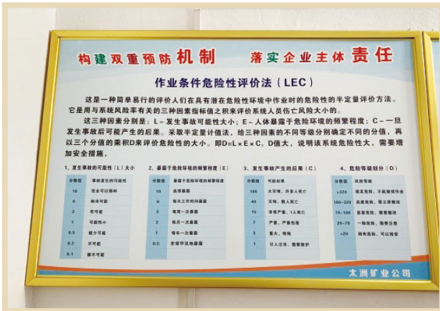
Method of Risk Assessment for Operation Conditions in Mines 於礦山的作業條件危險評價辦法