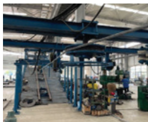
Daily operations of Tengzhou Kaiyuan