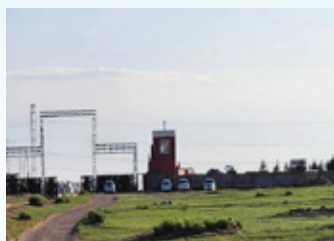
Choir Logistic Platform