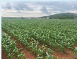
Yunnan Agricultural Base