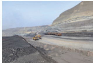
Daily operations of Xingliang Mine