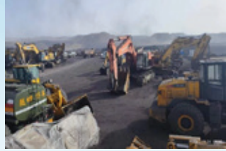
Mining machineries on standby in the mining area