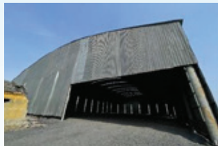
Daily operations of Shandong Kailai