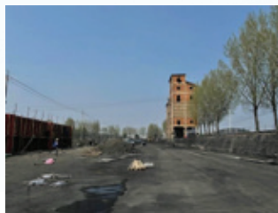
Shandong Kailai Wall Reconstruction