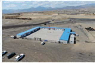
Xingliang Mine's Staff quarters