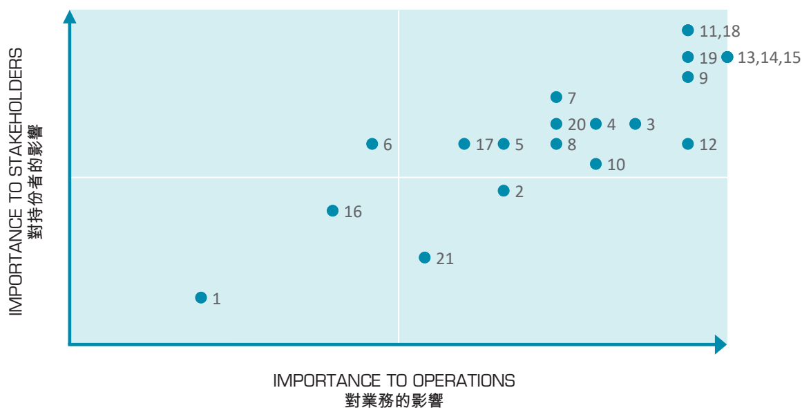
MATERIALITY ASSESSMENT MATRIX 重要性評估矩陣

根據對所有持份者重要性評估結果的分析及總結，我們得出了以下重要性評估矩陣，其中重要性評估矩陣所披露的下列重要事宜乃本集團可持續發展的主要影響層面。於考慮所有環境及社會責任時，本集團將尤其關注此等方面。