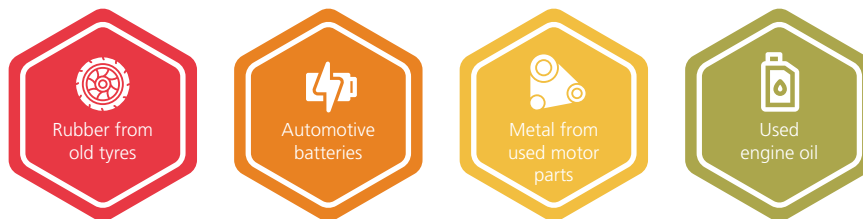
Figure 2 Recycling Initiatives

Consistent with past years, the Company put in place several initiatives to reduce our waste, mainly through recycling old materials. For instance, rubber from old tyres were collected and sold to recycling companies to generate additional revenues which were in turn used to handle waste management.