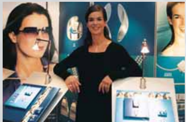
Katarina Witt proudly presents her new silver collection "feelings Katarina Witt", Berlin, 2001