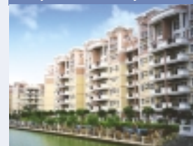
Phase VIII of Lexi New City (Fanghua Garden – Luotao South Zone Villa) Shajiao Island, Panyu

Total G.F.A.: approx. 2,576,000 sq.ft.; 25% owned by Group. This project was completed in December 2001.