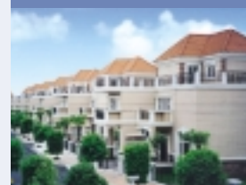
Phase IX of Lexi New City (Green Island House) Shajiao Island, Panyu

Total G.F.A.: approx. 683,000 sq.ft.; 25% owned by Group. This project was completed in February 2002.