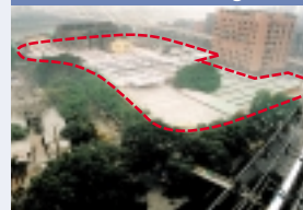
River Pearl Plaza – Blocks A, B & C Yuexiu District, Guangzhou

Total Planned G.F.A.: approx. 4,041,000 sq.ft.; Respectively 68.4%, 62.0% and 72.0% owned by Group. This project comprises 3 sites and is planned for the development of a mixed-use complex. Demolition and site clearance works are in progress.