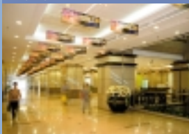
Henderson Centre — Henderson Shopping Centre, Beijing

Forming as a part of Henderson Centre, this retail shopping facility has 3 above-ground levels and 2 basement levels. Total G.F.A. of the shopping centre is approx. 888,000 sq.ft..