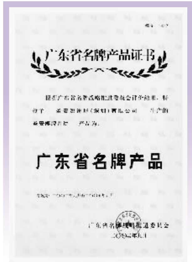
Awarded issued by Guangdong Provincial Authority to Saint Honore's Mooncake

Bread Boutique recorded steady growth this year again. Though we did not add any new outlets this year, its sales increased by 3.9%, which was achieved by the joint effort of different marketing campaigns launched with our promotion partners and the recognition of our improved products quality by customers. To remain competitive, we also diversified into selling Chinese dim sum in some of our outlets. In view of overwhelming acceptance by customers, we shall extend this new product line to the whole chain in the coming year. To maximize the revenue generated on per square foot of leased premises, we have split a few existing shops into two selling the Saint Honore products side-by-side to each other.