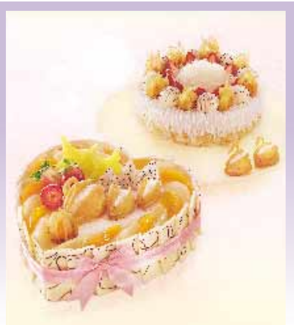
Saint Honore Mother's Day Cake Series: