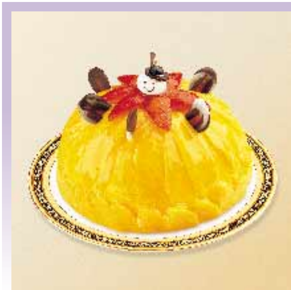
Mango Crispy Cake

During the year, the Group released the pledge of certain of its bank balances. Our freely held cash on hand increased from HK$79.7 million to HK$92.2 million even though we have spent HK$28.4