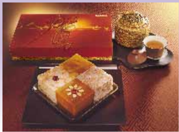
Saint Honore Chinese New Year Puddings

At 31 March 2003, the Group had a total of 1,670 (2002: 1,460) full time employees. Employees are remunerated based on basic salaries and sales incentives are payable to some operational staff. Bonuses were discretionary in nature and based on the performance of the employees and the Group. The Company