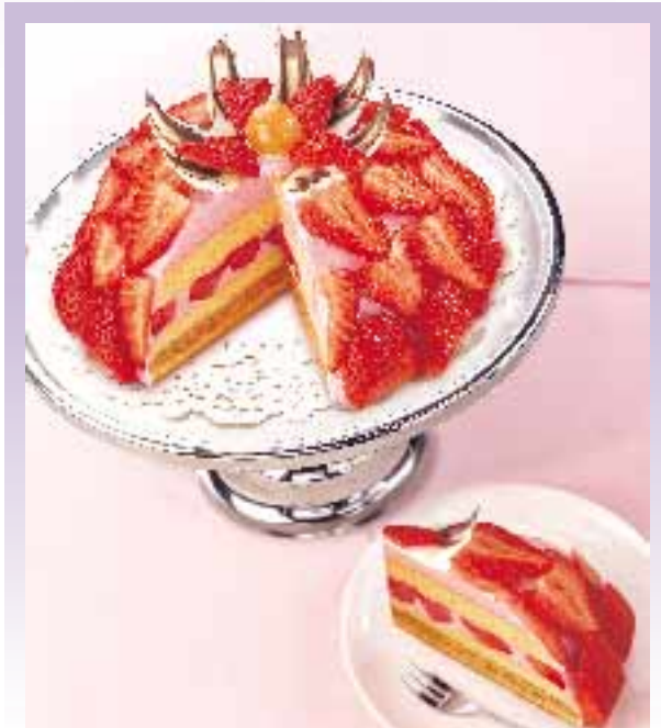
Strawberry Crispy Cake