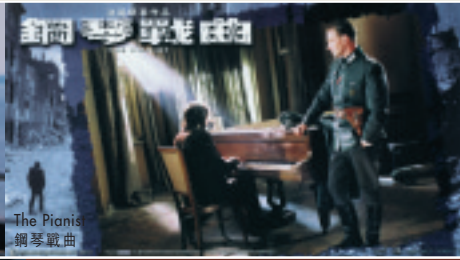
The Pianist 鋼琴戰曲