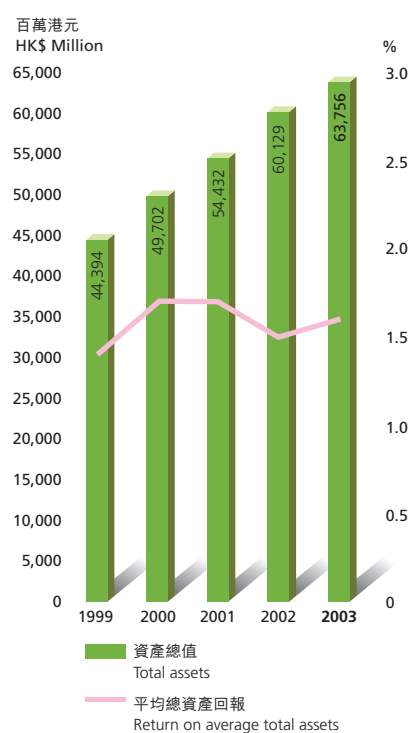
資產總值 / 平均總資產回報 Total assets / Return on average total assets