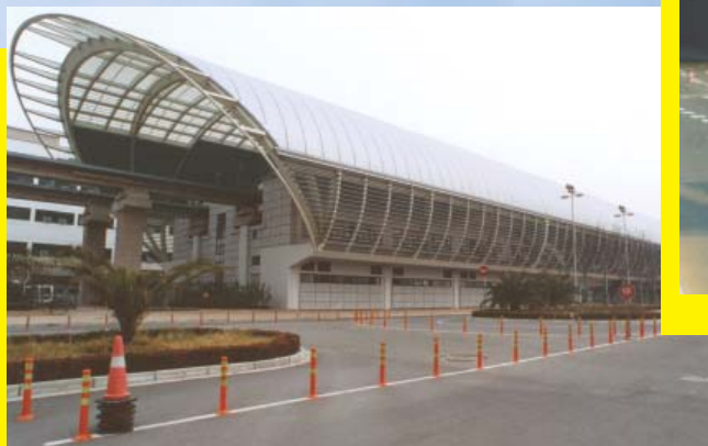
上海輕軌 Shanghai Lightrail