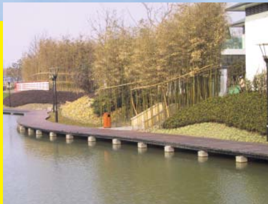
上海天安別墅 Shanghai Tian An Villa