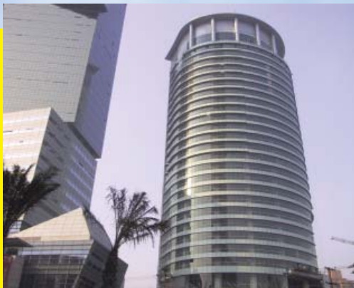
上海天安中心 Shanghai Tian An Centre