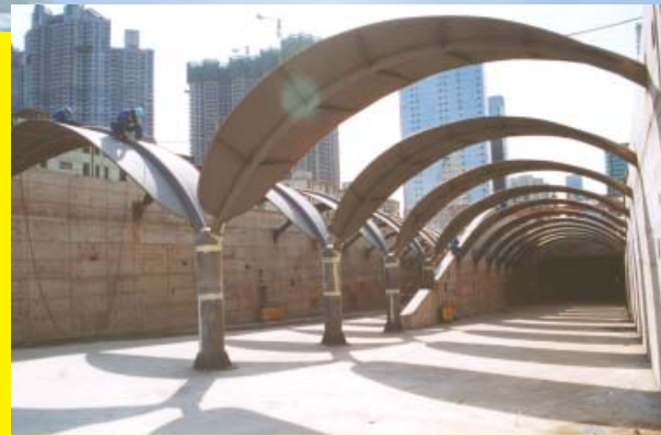
上海復興東路隧道 Shanghai Fuxing East Road Tunnel