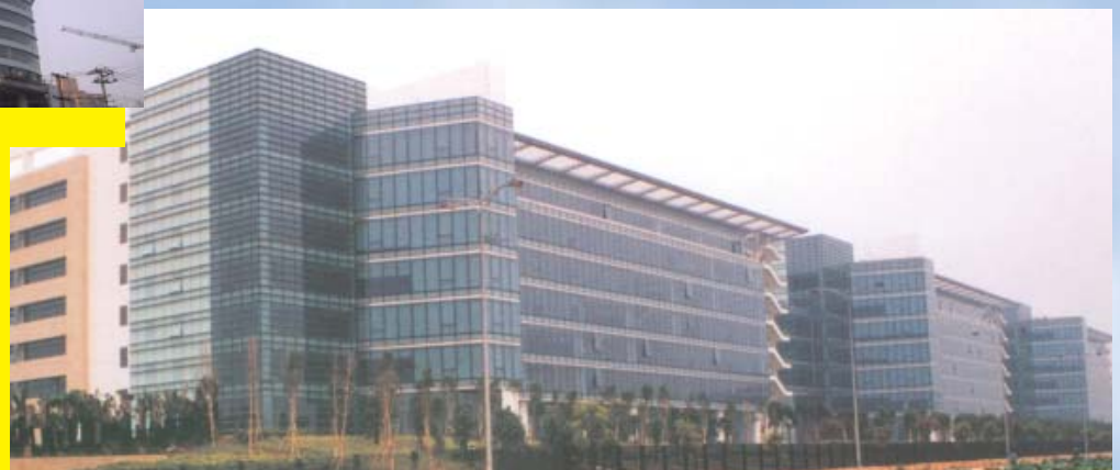
深圳華為中心 Shenzhen Huawei Centre