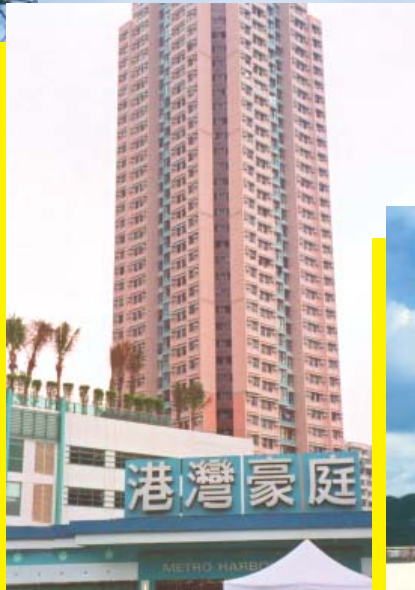
大角嘴港灣豪庭 Metro Harbour View in Tai Kok Tsui