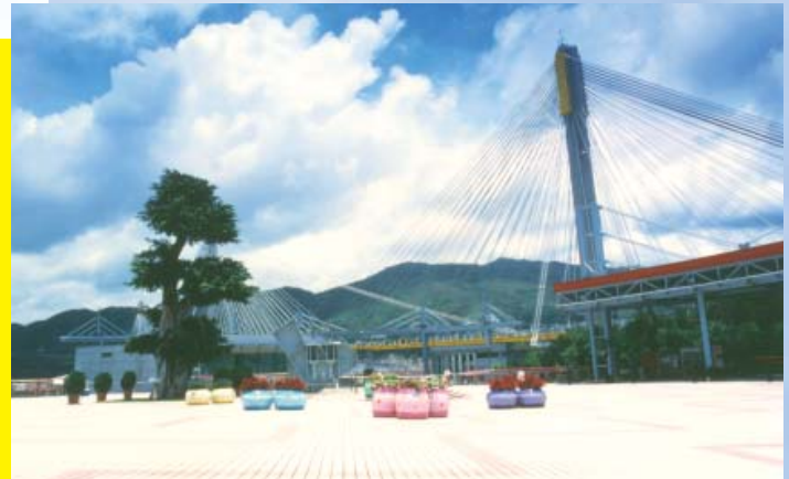
青馬大橋觀景台 Tsingma Bridge Panoramic Terrace