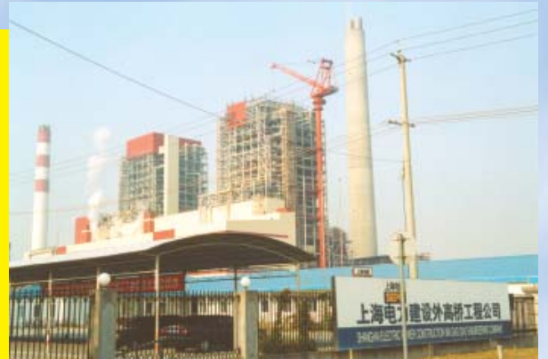
上海外高橋電廠二期 Shanghai Waigaoqiao Power Plant Phase II