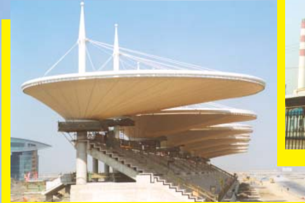
上海 F1 賽車場 F1 Racing Circuit in Shanghai