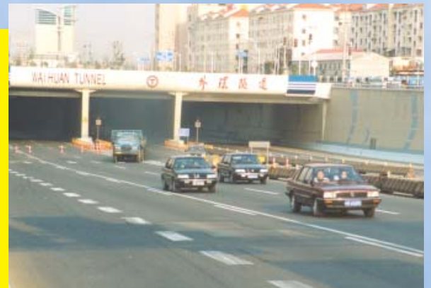
上海外環隧道 Shanghai Outer Ring Immersed Tube Tunnel