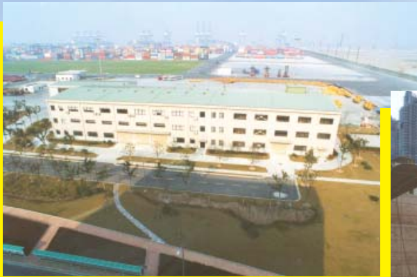
上海外高橋碼頭 Shanghai Waigaoqiao Terminal