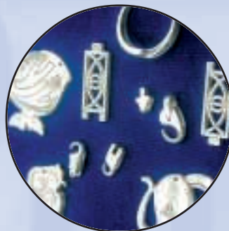
Jewelry & Ornaments Manufacturers