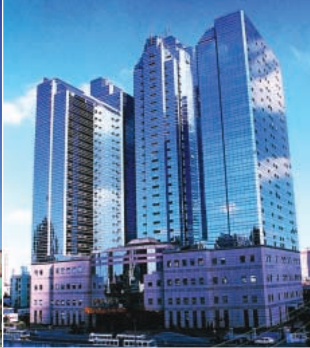
Tomson Business Centre 湯臣商務中心大廈