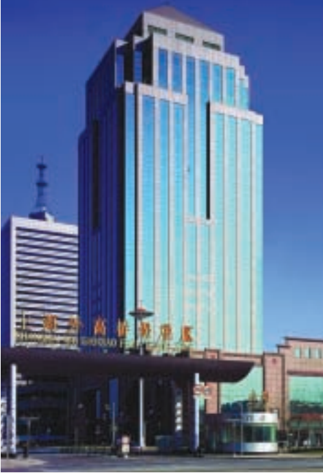
Tomson International Trade Building 湯臣國際貿易大樓