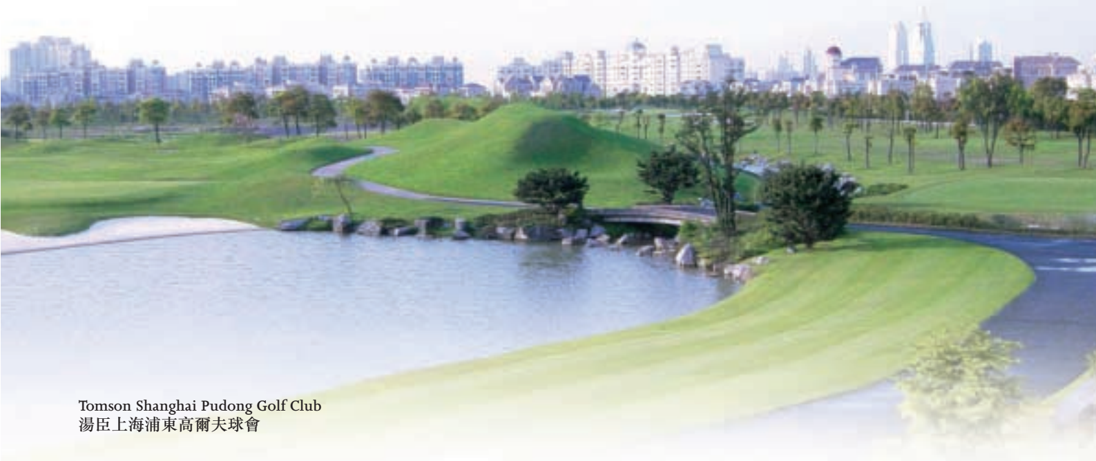
Tomson Shanghai Pudong Golf Club 湯臣上海浦東高爾夫球會