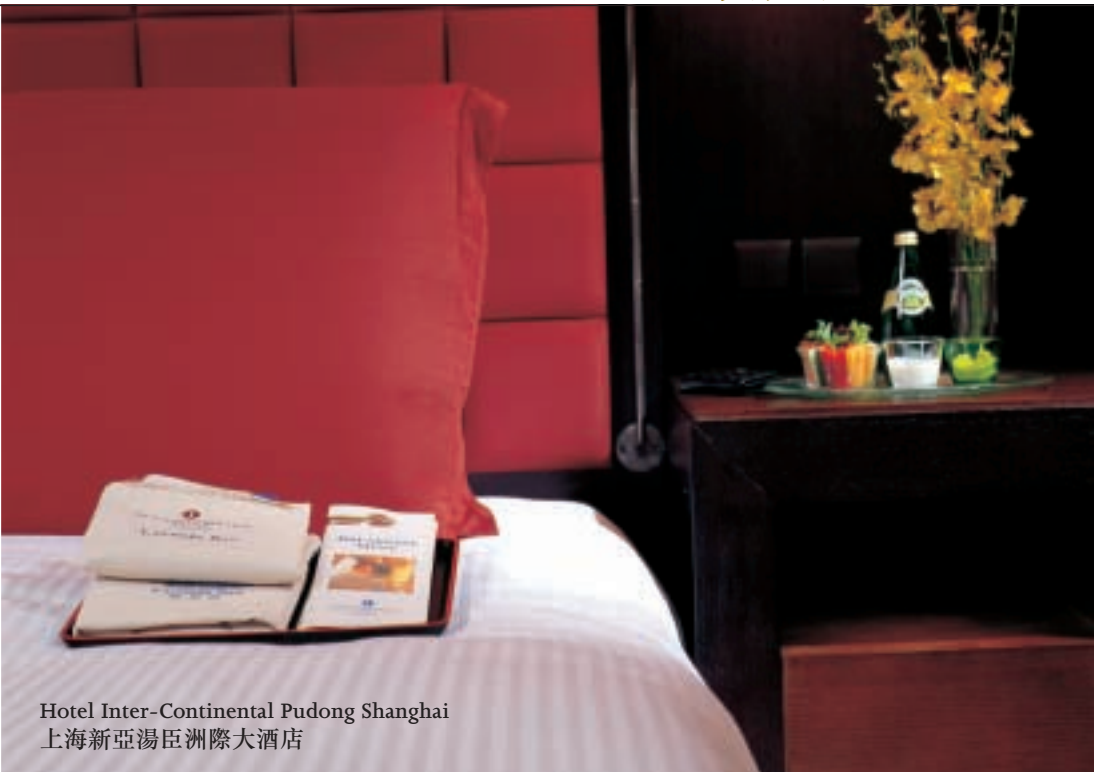
Hotel Inter-Continental Pudong Shanghai 上海新亞湯臣洲際大酒店