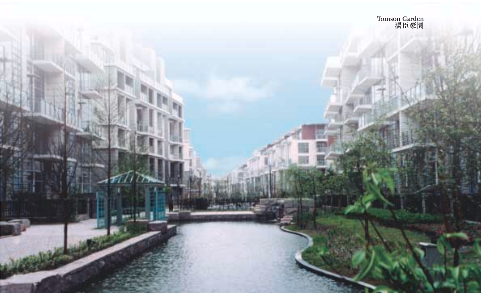
Tomson Garden 湯臣豪園

湯臣豪園為另一項大型住宅物業項目，分兩期發展，並位於浦東張江高科技園區及湯臣上海浦東高爾夫球會側。整個項目之總樓面面積約為141,000平方米，並已售出98%。