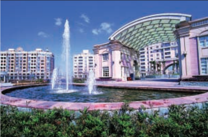
Tomson Golf Garden 湯臣高爾夫花園