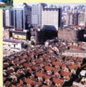
上海靜安 Jing An, Shanghai