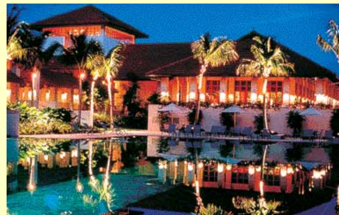
The Terrace, The Sentosa Resort and Spa

Our experience in the property field gives us an ability to provide a wide range of property-related services to the local and international market. Our subsidiary, Imperial Bathroom Products Ltd, supplies innovative products of acclaimed quality, ranging from bathroom products to sanitary appliances, to Hong Kong, the Mainland China and overseas markets, and has become a prestigious brand and best seller in many markets over the previous decade.