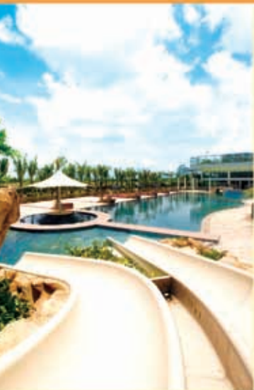
藍天海岸會室外游泳池 Outdoor Swimming Pool, Skyline Privilege Club