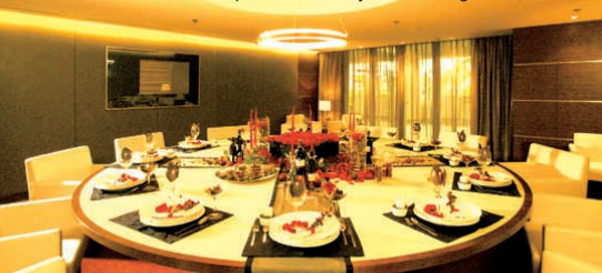
Music Studio/Video Banquet Room, Skyline Privilege Club