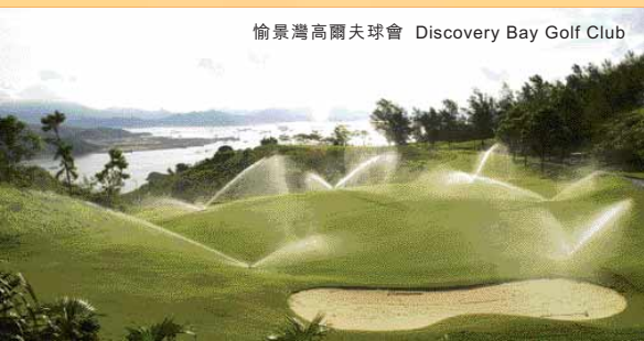
愉景灣高爾夫球會 Discovery Bay Golf Club