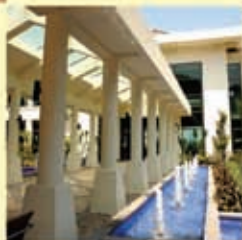
愉景灣海澄湖畔住客會所 Club Siena, Discovery Bay