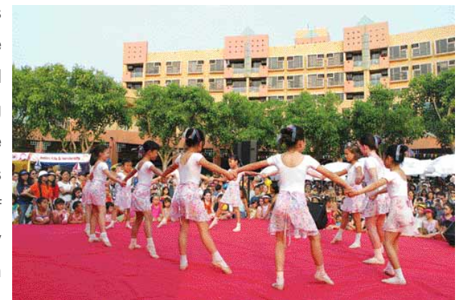
愉景灣內經常舉辦不同類型的社區活動 Discovery Bay offers a wide range of community activities