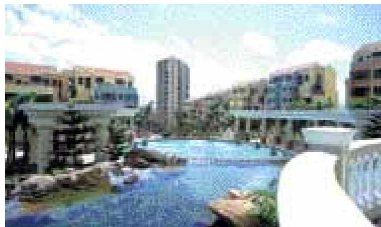
愉景灣海藍居 La Serene, Discovery Bay