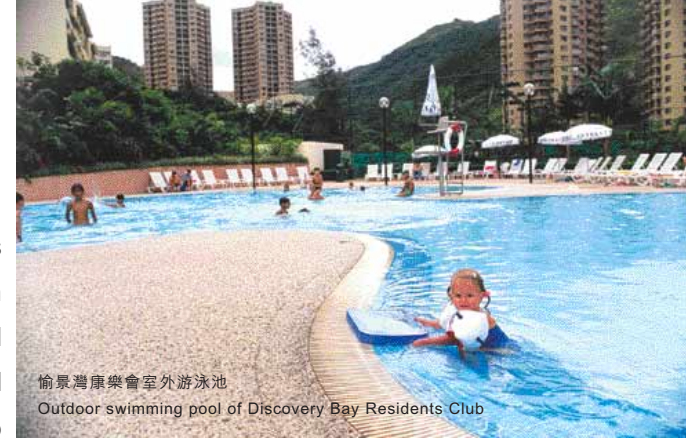
愉景灣康樂會室外游泳池 Outdoor swimming pool of Discovery Bay Residents Club

The Group also maintained its commitment to enhancing the quality of life in Discovery Bay and its cosmopolitan character. During the year, a Discovery Bay lifestyle promotion campaign was launched for the well-being of residents. The Discovery Bay Activities Centre was opened in September 2003, offering a series of services including recreational and cultural programmes.