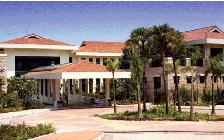
愉景灣海澄湖畔住客會所 Club Siena, Discovery Bay

隨著市場氣氛逐漸改善，本集團佔百分之五十權益的愉景灣發展項目，銷售成績明顯向好。愉景灣第十二期海澄湖畔於回顧期間的銷售情況，不論在數量及售價上均令人滿意。截至二零零四年三月底為止，已售出超過五百個單位。當中花園別墅及低座洋房最受買家歡迎，平均每平方呎樓面價分別為港幣五千四百五十二元及港幣三千二百零五元。理想的銷售情況顯示愉景灣對追求恬靜生活及高質素居住環境之本地及外籍人士均具有莫大的吸引力。集團準備於二零零四／二零零五年度推出海澄湖畔二期的餘下單位。