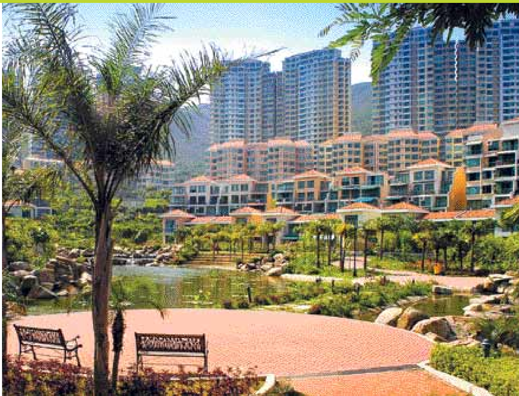
愉景灣海澄湖畔 Siena, Discovery Bay