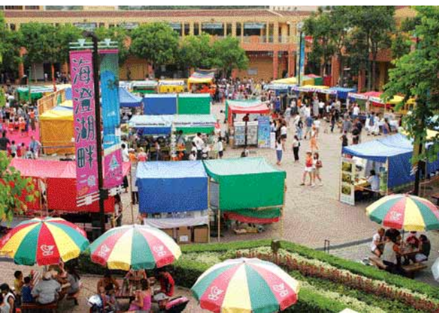
愉景灣跳蚤市場 Flea Market in Discovery Bay

In view of the structural changes in travel patterns, the transportation services operated by the Group at Discovery Bay were reorganised. In April 2004, new ferry and coach schedules were introduced,