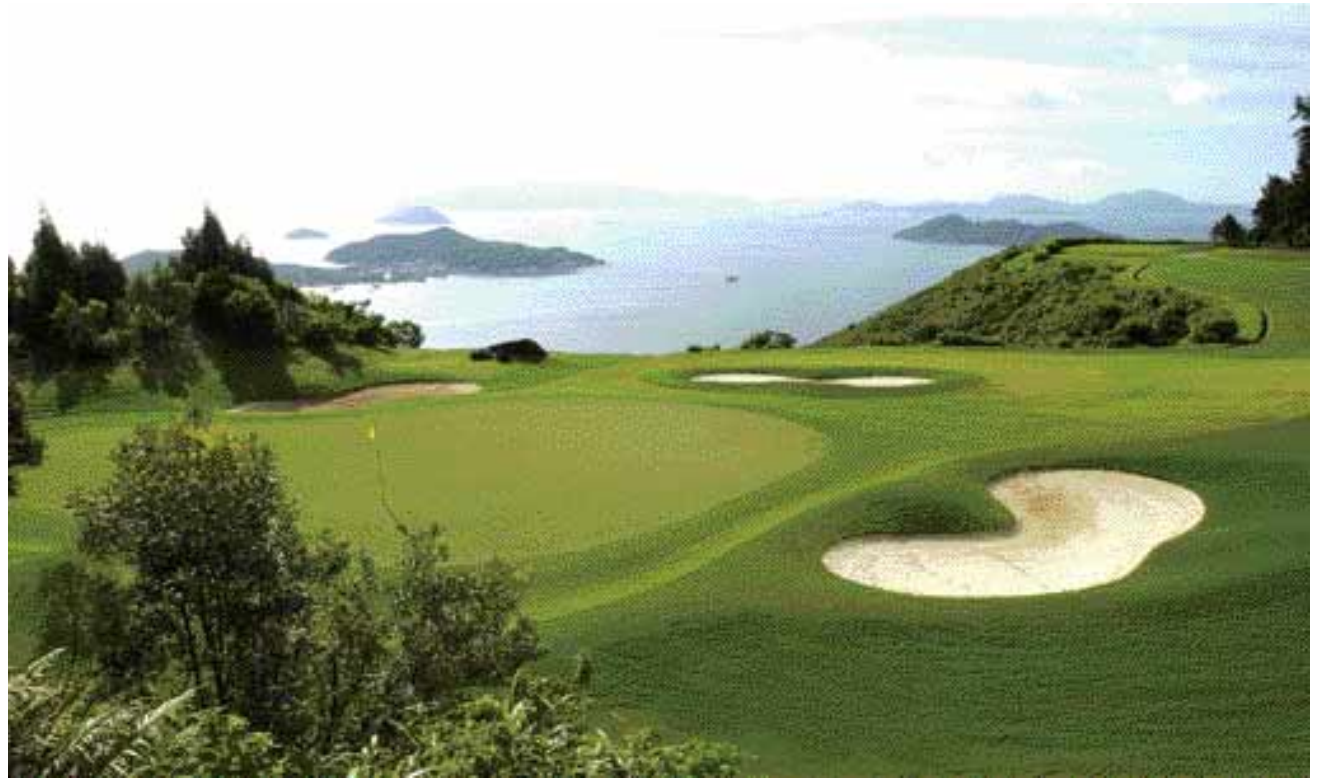
愉景灣高爾夫球會 Discovery Bay Golf Club

為配合大嶼山的長遠發展策略，多項大規模旅遊及經濟基建等工程亦正在進行，其中包括香港迪士尼樂園、亞洲國際展覽館、東涌吊車系統、增值物流園，以及被列為長遠規劃的港珠澳大橋。此外，為連接香港迪士尼樂園而興建的新地鐵站將可大幅改善北大嶼山之交通網絡。這幾方面的重要發展將為本港帶來不少商機，愉景灣因其地理上之優勢亦必可受惠。為充份發揮這些發展潛力，集團將繼續與居民保持密切溝通，提供最切合居民要求的服務，建立更理想的居住環境。