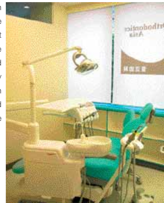
亞正齒科 Orthodontics Asia

In late 2002, the Group made another important investment in the Mainland China and entered into agreements with Jingan District Government of Shanghai, whereby the Group has been granted rights to develop several adjacent prime sites in Jingan District into a comprehensive development comprising of deluxe hotels, offices, serviced apartments, retail and residential. The sites are strategically located in a prime location in Jingan, and served by an excellent transportation network, including the existing and planned underground rail stations nearby. The sites will be