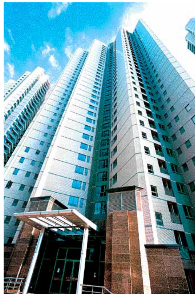
上海嘉里華庭二座 Chelsea, Shanghai

In Tianjin, the six-level retail mall, The Exchange, in which the Group has a 14.5 per cent interest, was 96 per cent leased and the newly completed northern office tower was 58 per cent occupied as at the end of March 2004. Marketing plans have been drawn up to increase occupancy level further.