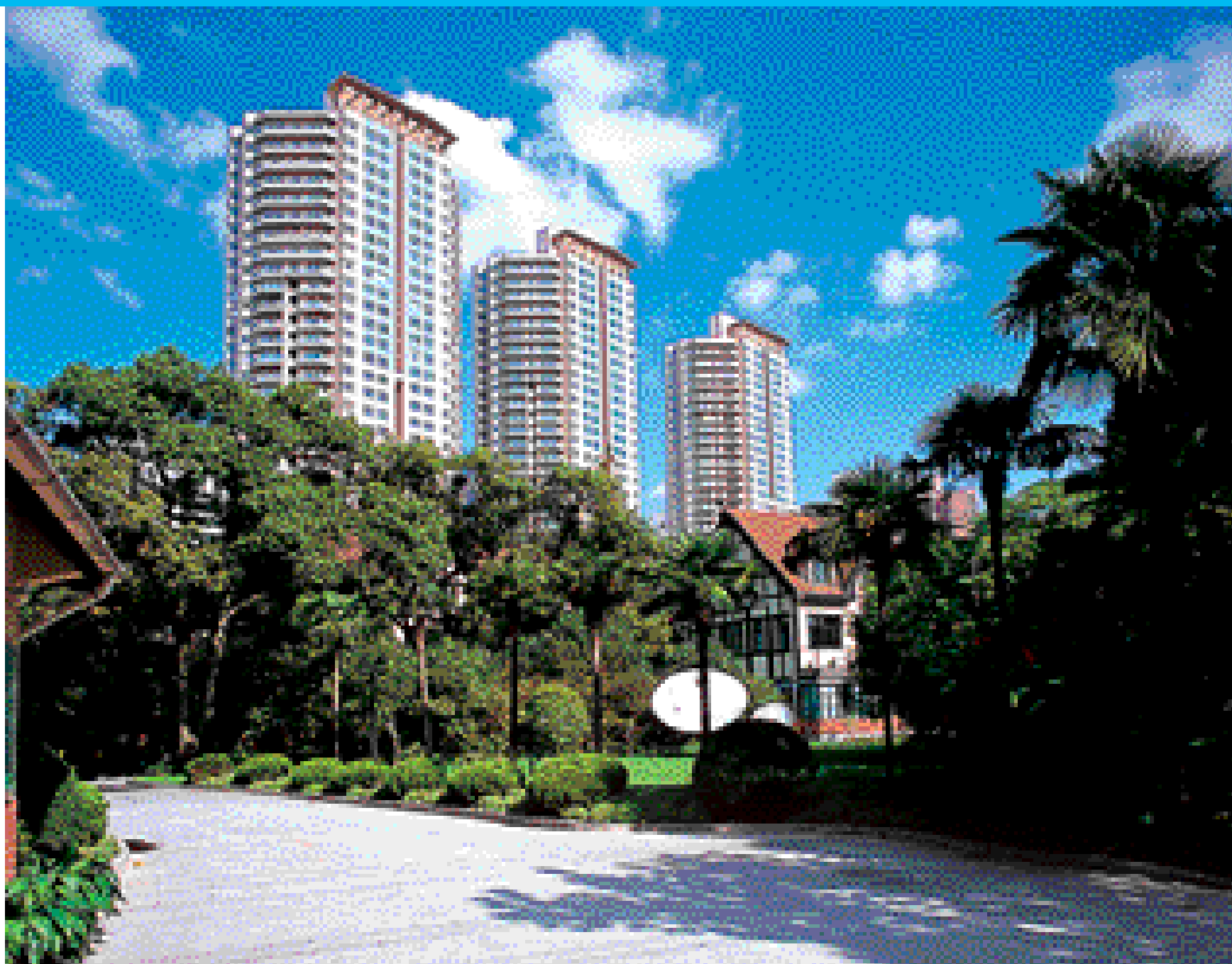
上海嘉里華庭二座 Chelsea, Shanghai