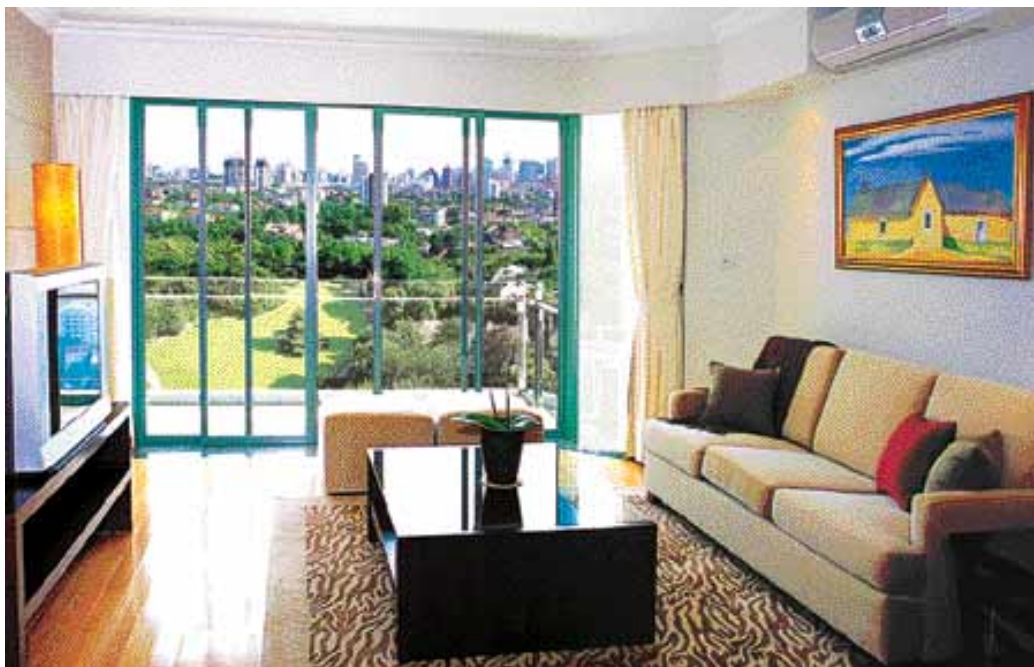
上海嘉里華庭二座 Chelsea, Shanghai

二零零二年底，集團於國內作出另一重要投資——與上海靜安區有關當局達成協議，將該區一貴重地段重建為綜合性發展項目，包括豪華酒店、辦公室、服務式住宅、零售物業及住宅等。此項目位於靜安區優越地段，擁有完善的交通網絡，未來更計劃增建地鐵支線。集團計劃將此項目發展成靜安區核心地帶之新地標，並將成為融滙