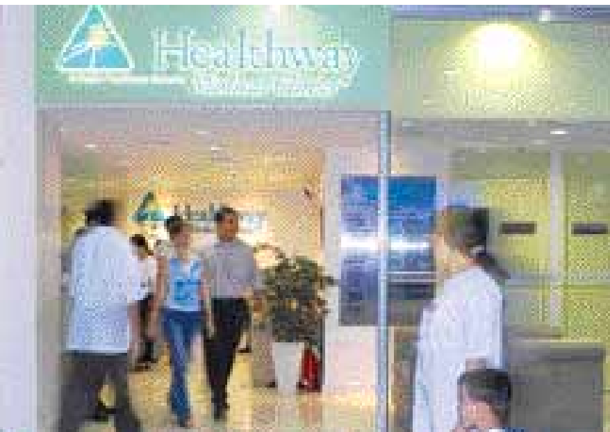
位於菲律賓的Healthway醫療中心 Healthway Medical Clinics, The Philippines

中西文化、新舊概念，以至結合文化與科技之新焦點。建基於集團發展愉景灣之成功經驗，靜安發展項目勢必成為上海未來獨特之新標誌，為當地居民及外地人士創造一個集文化精萃與商業風貌於一身的項目。