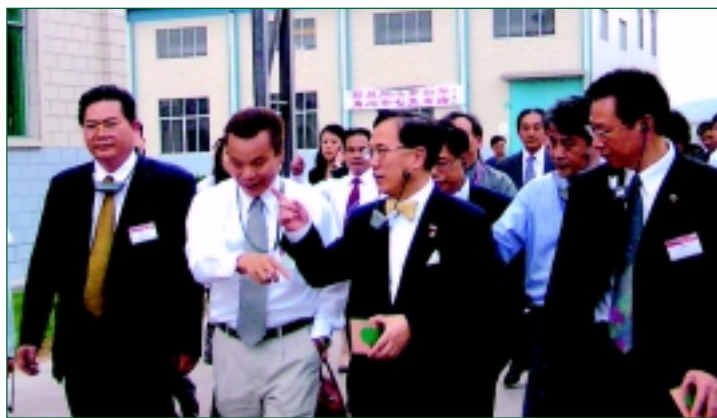
Mr. Donald Tsang, Chief Secretary for Administration of the HKSAR was among the guests visiting our copper foil plant during the trip of the Hong Kong officials to the Pearl River Delta in June 2004.

化工部門繼續高速增長，多個主要化工項目正在展開。市場對燒鹼需求殷切，在湖南衡陽的燒鹼廠擴產計劃正如期進行，預期每月產能可在本年中增加二倍。於河北的焦炭甲醇廠，其焦炭生產已全面展開，預期在六月將可開始生產甲醇。分別在重慶及海南省興建的兩家甲醇廠，工程進展順利，預計在二零零六年底落成。此外，集團正於廣東惠州石油化工區設立一家苯酚及丙酮／雙酚A化工廠，該地區能夠提供穩定的原料供應。