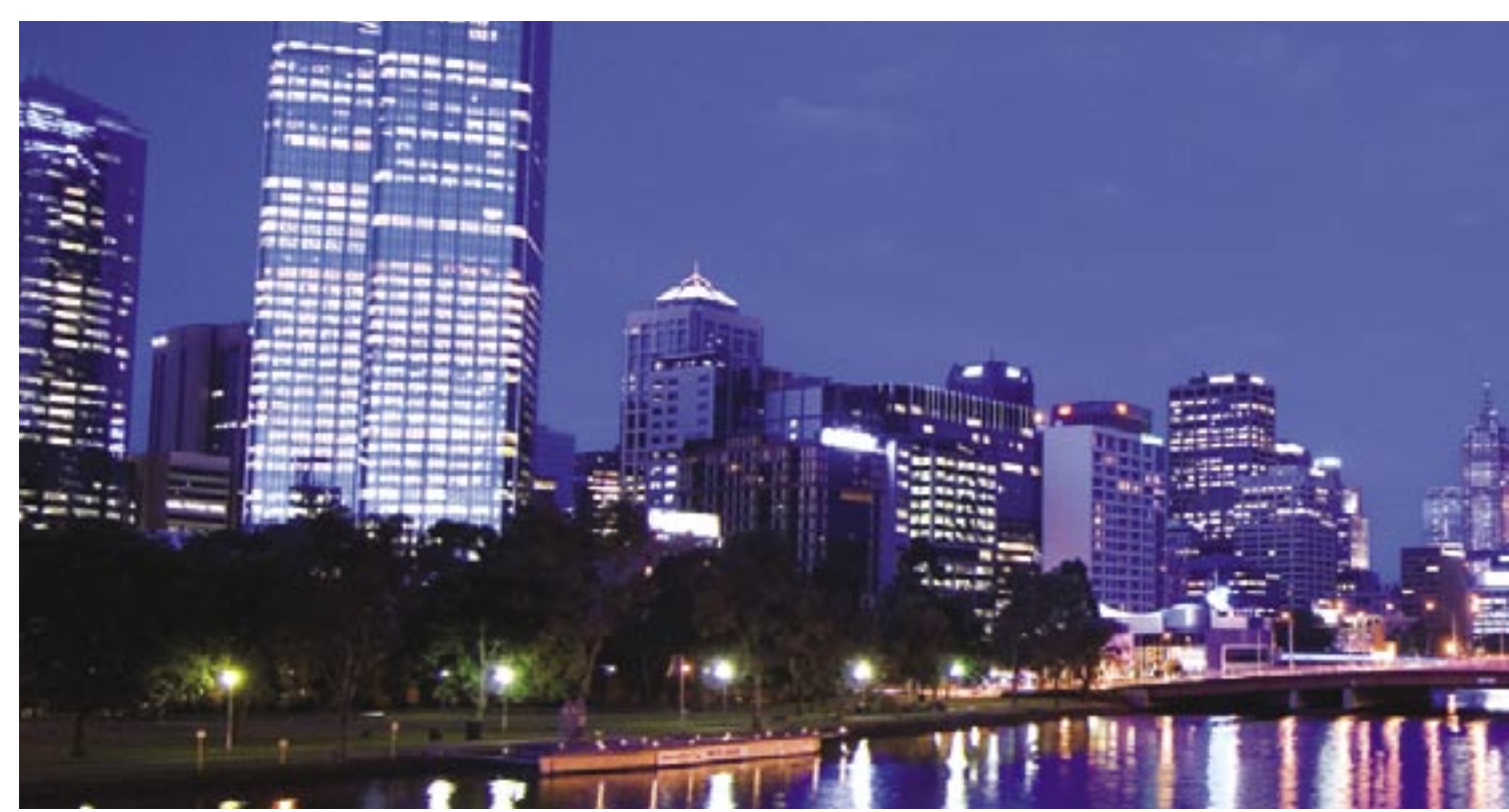
Melbourne at night. CitiPower supplies electricity to the heart of Melbourne and to more than 280,000 customers in the inner suburbs.