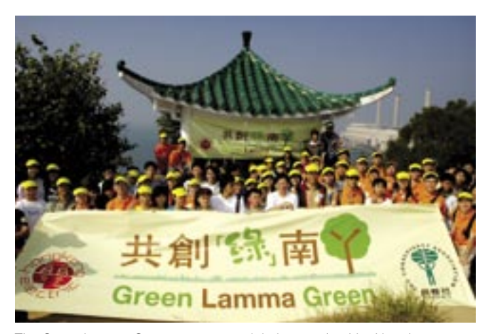
The Green Lamma Green programme jointly organised by Hongkong Electric and the Conservancy Association has pledged to plant 2,000 trees in 3 years to promote eco-tourism and sustainable development.

Promoting energy efficiency among students is the aim of our Smart Power Campaign, launched in 2003. In 2005, close to 4,000 students from 23 primary schools took part in various activities. We launched a new round of activities in November 2005 with the theme of renewable energy.