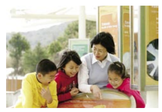
As part of Hong Kong's first wind power station, an adjacent exhibition centre educates visitors on renewable energy and provides real-time data on wind velocity and power output.