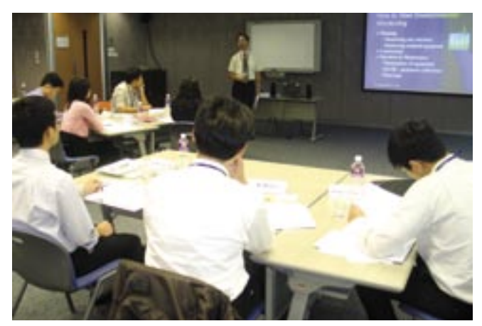
Training the next generation of managers and leaders is an ongoing process at Hongkong Electric. Our workshops cover everything from project management to environmental protection.