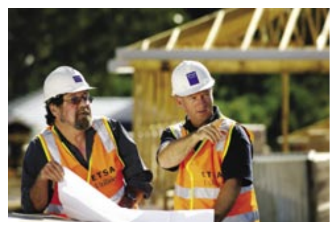
Two ETSA Utilities employees go over plans for new customer connections near Adelaide. ETSA now installs underground powerlines in all new developments.