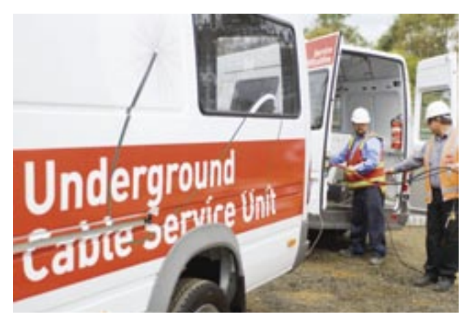
CitiPower and Powercor took the lead in introducing technology that accurately pinpoints the location of an underground cable and minimises the area needed to excavate to repair a fault.