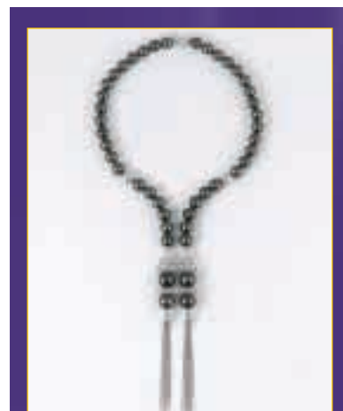
朱慧安 冠軍 珍珠串 [赫] Chu Wai On Champion Pearl Row "Banquet"