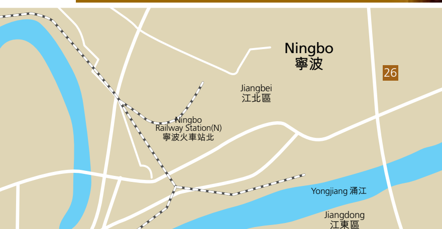
26. Ningbo Gaojiaoyuan District Project 寧波高教園區項目