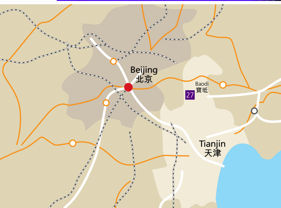
27. Tianjin Jingjin New Town 天津京津新城