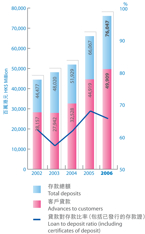
貸款 / 存款總額 Total advances / Total deposits