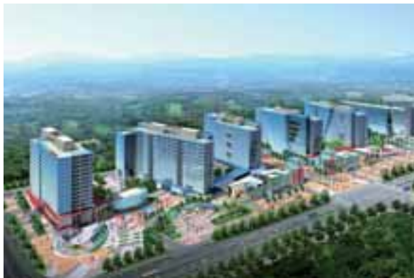
Perspective of Shenzhen Longgang New Cyber Park 深圳龍崗數碼城 (效果圖)

Pursuant to its strategy of increasing rental income and maximizing development profit, Tian An managed its portfolio so as to retain more real estate for the generation of rental income. Tian An recorded sales of approximately 79,100 m 2 total GFA in 2006, compared to 138,000 m 2 in 2005. The benefits of this strategy should be realized in 2008 and 2009 when substantial developments held for sale will be available for marketing. These developments include Shanghai Tian An Place in Cao Bao Lu, Shanghai Tian An Villa in Sheshan, The Manhattan in Wuxi and Shenzhen Tian An Golf Garden (Phase 3). These properties have significantly increased in value in recent years and Tian An expects to record substantial profit on any disposals. The rental income increased by 70% in 2006 and is expected to continue to increase in the next few years as a larger portion of Tian An's investment properties are completed, including the "Flour Mill" project in Shanghai.