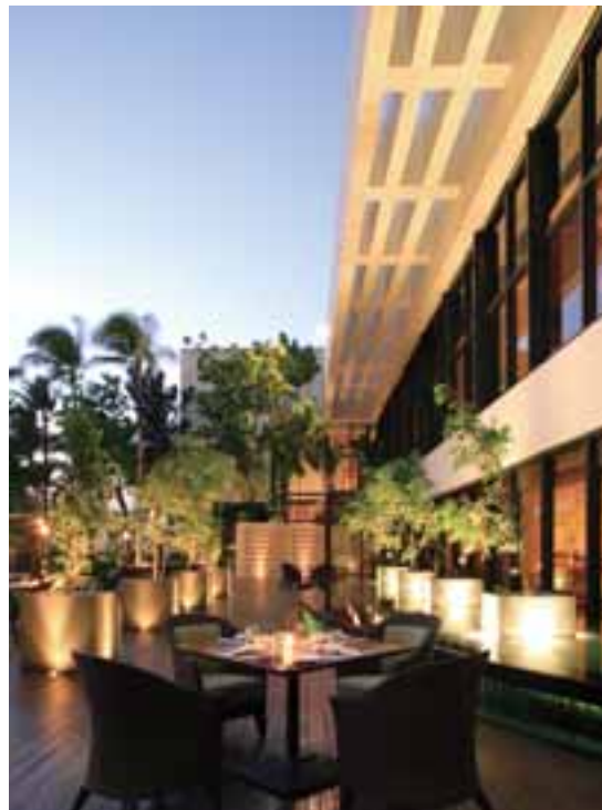
Philippine Plaza Hotel, Manila 馬尼拉 Philippine Plaza 酒店

Allied Kajima Limited ("Allied Kajima"), 50% indirectly owned by Allied Properties and holding properties including Allied Kajima Building, Novotel Century Hong Kong hotel and the Philippine Plaza Hotel, contributed a profit increase of 50.7% in 2006 as compared to 2005. The increase was mainly due to a revaluation of its investment property and a strong performance by Novotel Century Hong Kong hotel which recorded significantly higher average room rates.