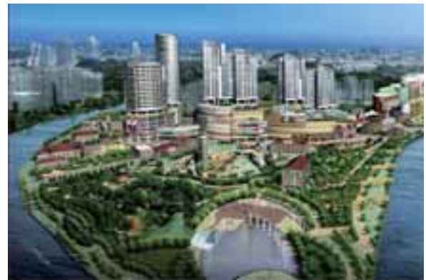
Perspective of Shanghai Tian An Sunshine Peninsula 上海天安陽光半島 (效果圖)

Tian An has a current landbank of total GFA of approximately 6,322,000 m 2 (total GFA attributable to Tian An is approximately 4,615,000 m 2 , consisting of 222,000 m 2 of completed investment properties and 4,393,000 m 2 of properties for development), located mainly in Shanghai and Shenzhen, as well as other cities.