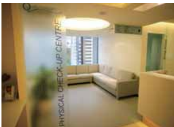
Quality HealthCare Physical Check-up Centre 卓健體檢中心

卓健於二零零六年呈報之純利為65,100,000港元，較二零零五年之純利56,100,000港元增長16%。卓健於二零零六年之營業額由二零零五年之822,800,000港元增長8.6%至893,700,000港元。