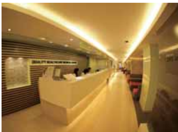
Quality HealthCare Medical Centre 卓健醫療保健中心

The continued growth in profit resulted from ongoing enhancement to customer services, improvements in operational efficiency, and closer teamwork between frontline and back office staff. The total number of client visits to QHA's medical network continued to increase, and there was overall growth in the total number of corporate clients.