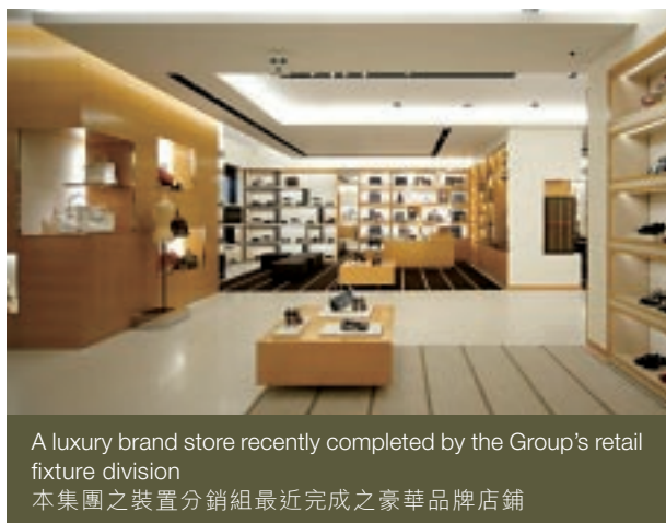
A luxury brand store recently completed by the Group's retail fixture division 本集團之裝置分銷組最近完成之豪華品牌店鋪

I am both happy and very proud to report to you that the Group's full year results for 2006/2007 are the best ever achieved in the Group's history. Records were set for total revenue, total profits and return on shareholders' funds. Revenue for the year ended 31 March 2007 was HK$636.8 million, up 31.4% as compared with the previous year. Net profits were HK$78.3 million, up 101.9% as compared with the previous year. And, return on shareholders' funds was 26.4% compared to 17.2% for the previous year. These results are gratifying because the furniture industry has not grown significantly over the past year and reinforced the position of Decca as a diversified industry leader.