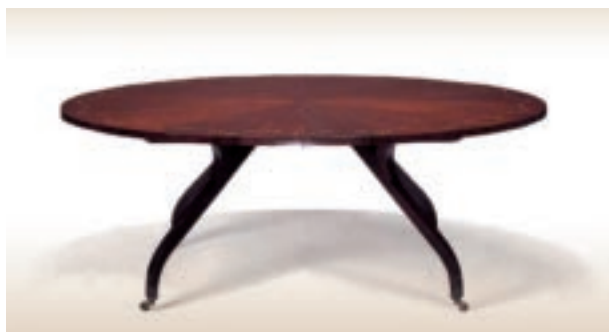
The Classics Collection of the Group's Bolier & Co. furniture line 本集團之Bolier & Co. 傢私產品中之Classics 系列

Once again, the Group enters the next year with a record backlog. Orders totaling over HK$303.3 million were already signed as of March 31, 2007. The overall number of inquiries from Europe and the continued interest generated in the U.S. hospitality sector lead us to believe that the Group should continue to enjoy double-digit growth in both revenue and profits.