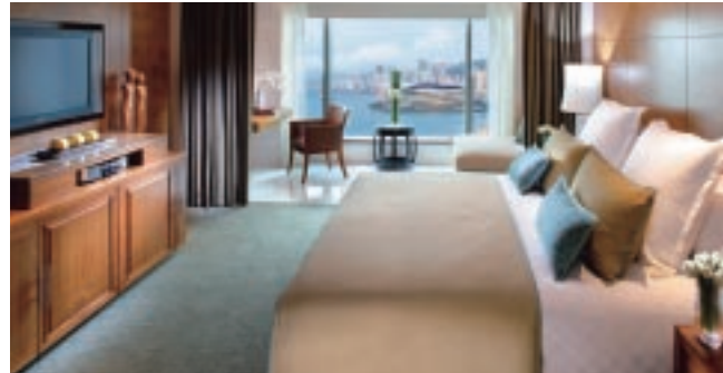
Typical Guestroom at the Mandarin Oriental Hotel, Hong Kong, one of the fitting out projects undertaken by the Group. 本集團承接香港文華東方酒店內標準客房之室內裝飾工程

總括而言，本集團在可見將來會繼續此正確方向。我們會繼續分散收入來源及增加策略性的生產地點以擴大本集團的機遇。本集團會繼續投資發展新技術以鞏固在全球最先進木制品公司之一的地位。