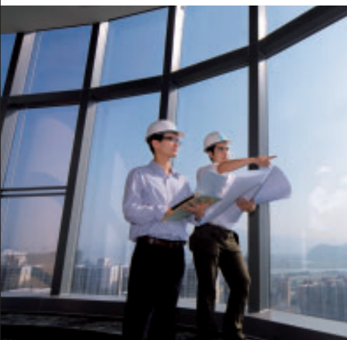
Dedicated professional team meets clients' requirements 專業的團隊以熱誠的態度滿足客戶要求

多方面的專業能力，是保華建業賴以成功的重要因素；滿意的客戶不但樂於一再與其合作，更向其他公司推薦保華建業，為業務帶來持續增長。憑藉其超過60年的豐富經驗及擁有全面專業知識的團隊，集團正開拓全球各地之商機，特別是發展迅速的澳門及中國內地市場。保華集團會進一步鞏固其在建造業界的地位，並拓展物業發展及投資的業務。