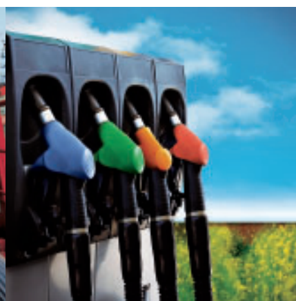
Minsheng Gas fuels for the green 民生石油輸送綠色動力