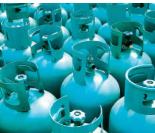
LPG distribution by Minsheng Gas 民生石油配送家用石油氣

內銷石油價格迅速上升，令液化石油氣市場的前景更為樂觀。而汽車以石油氣代替汽油既環保又高效益，實屬理想的選擇。保華將擴展其汽站網絡，從而提高儲庫的容量及產品使用量。