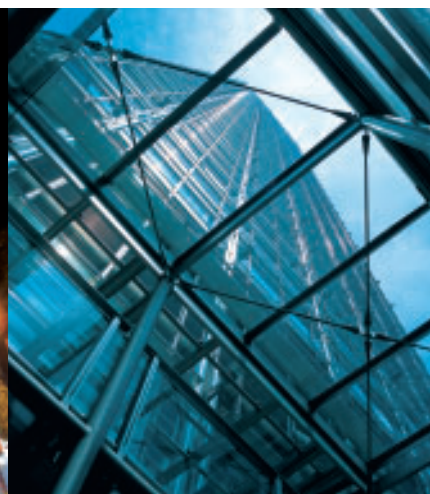
Building countless skyscrapers 興建為數不少的摩天大廈