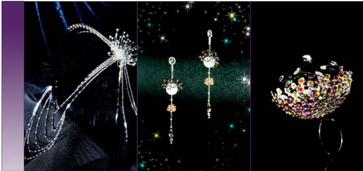
第八屆香港珠寶設計比賽 The 8th Hong Kong Jewellery Design Competition

獎項 Award: 優異獎 Merit Award 組別 Category: 其他類別 Other Categories 作品名稱 Title: 流水的力量 Power of Flowing Water