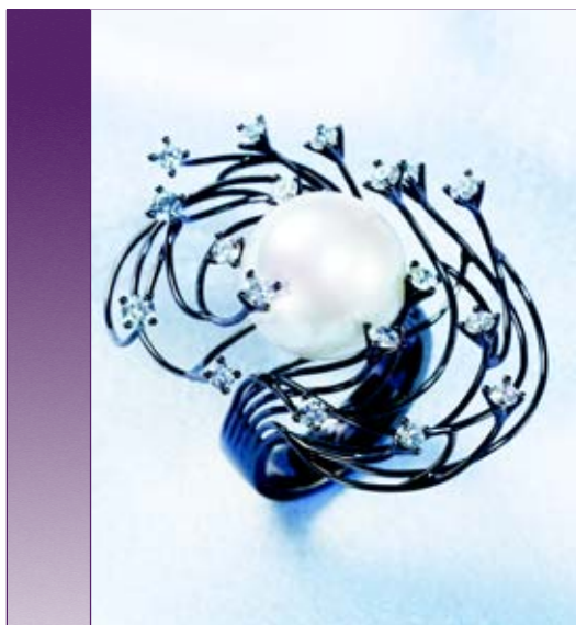
第六屆國際南洋珠首飾設計比賽 The 6th International South Sea Pearl Jewellery Design Competition

本集團的品牌推廣工作包括線上及線下模式，大規模投放的有電視廣告、平面雜誌媒體、戶外及目標互聯網廣告、網上直銷推廣及有大量名人參予之公關活動。包括：