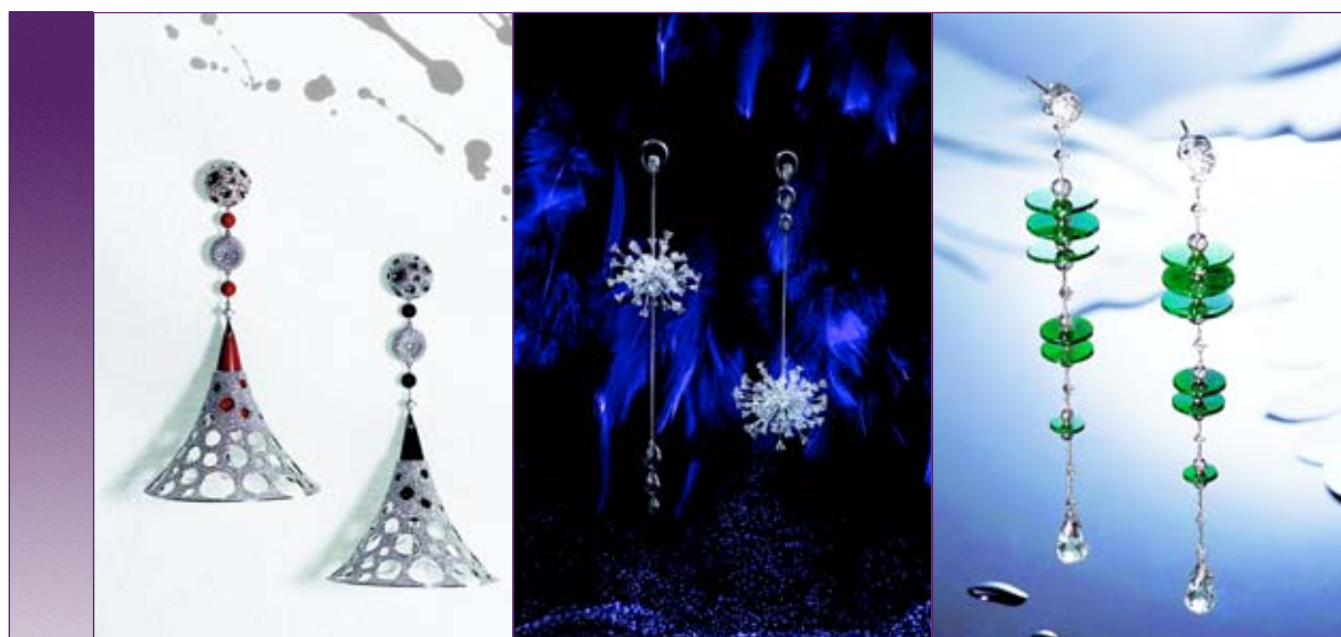
2006 國際珠寶設計創意大賽 International JDI Competition 2006

為配合擴展中國市場的發展策略，本集團亦於北京其中一些人流最暢旺的購物中心開設3間自營店，以抓緊2008年北京奧運會帶來的龐大商機。新店進一步擴大六福於中國的自營店版圖。與去年同期相比，本集團於年內在全中國積極增加約90間品牌商，令本集團於2007年3月在中國的品牌商總數增至超逾270間。