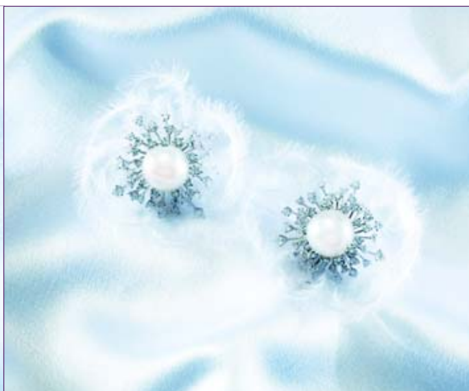
第六屆國際南洋珠首飾設計比賽 The 6th International South Sea Pearl Jewellery Design Competition

獎項 Award: 銀獎 Silver Award 組別 Category: 戒指 Ring 作品名稱 Title: 焦點 Focus