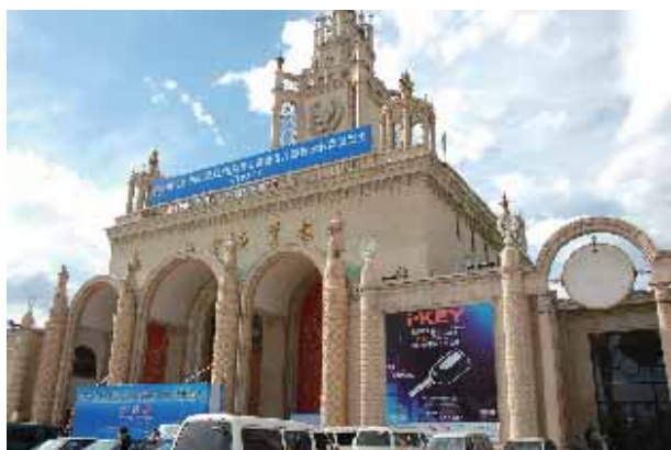
The Group participated at The 2nd China (Beijing) International Exhibition & Symposium on Police Equipment & Anti-Terrorism Technology & Equipment in May 2007. Champion's banner was prominently displayed at the main entrance of the venue.

Meanwhile, the Group's strategic investment in In-Car Telematics solutions, anti-radiation products to counteract radio emission from mobile phones, and ID card project with related IT security opportunities progressed as planned as we continued our marketing efforts. In May this year, the Group participated at The 2nd China (Beijing) International Exhibition & Symposium on Police Equipment & Anti-Terrorism Technology & Equipment (第二屆中國(北京)國際警用裝備及反恐技術裝備展覽會暨學術研討會), having been a participant at similar exhibitions in prior years. Partnering with a number of international vendors of advanced security solutions, the Group's new division, Champion Homeland Security, offers comprehensive customised solutions for integrated security systems ranging from access control, video monitoring, alarm processing, internal and external intruder detection, perimeter systems, communications network monitoring, to command, control and communications.