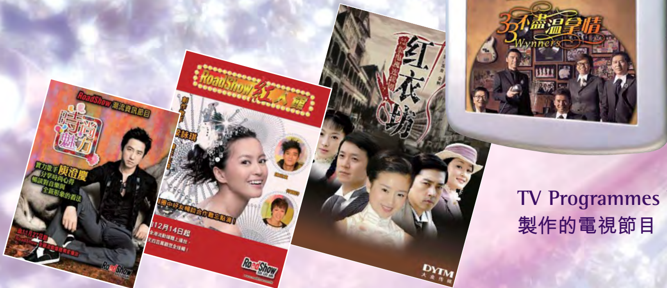
TV Programmes Produced 製作的電視節目