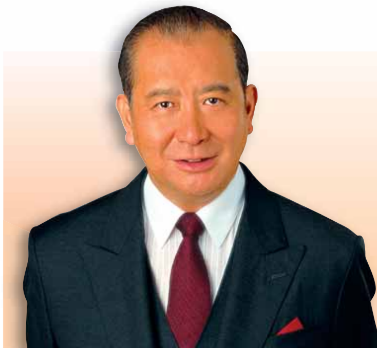
Dr. The Hon. Sir David LI Kwok-po Chairman & Chief Executive 主席兼行政總裁 李國寶爵士

In Hong Kong, BEA will place more emphasis on traditional banking business and products, including corporate banking, small-and-medium-size enterprise business, and consumer finance. Management will continue to manage the asset and liability mix proactively, in order to boost interest income and diversify revenue streams. In addition, the Bank will further leverage cross-selling opportunities with Group companies, Tricor Group, Blue Cross (Asia-Pacific) Insurance Limited and BEA Life, in order to raise fee-based income. BEA will also continue to identify and explore new acquisitions and strategic alliances.