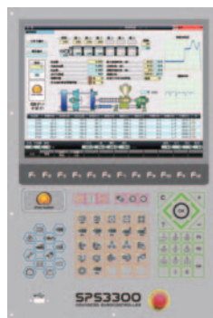
SPS3300 高級歐洲 聯網電腦控制器 SPS3300 EuroController