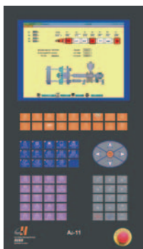
Ai-11 智能 聯網電腦控制器 Ai-11 Intelligent Computer Controller

As long as China continues in its current relaxed monetary policy and assistance to industries, the Group believes that its customers' demand for injection moulding machines will rebound to more normal levels. The Group has completed a large reorganization program and has started on a new marketing strategy during the past six months. It is now well positioned financially not only to successfully assail through the financial crisis but also to capture future opportunities when the market rebounds.