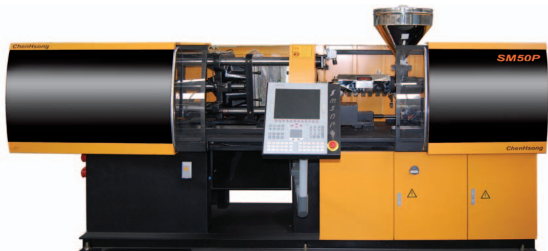
超霸全電動節能注塑機 SUPERMASTER Energy Saving All Electric Machine

The financial year of 2009 is one of the most difficult operating environments that the Group has ever encountered in its 50-year history. The “Global Financial Tsunami”, which started in late September 2008, pushed the economic and financial systems of many countries to the brink of collapse in just a few months. The broadness and speed of this crisis’ impacts are unprecedented, and global liquidity dried up extremely rapidly causing severe hardships to operators in a broad range of industries. Under such unprecedented circumstances, a company has only its financial strength, quality of management and quickness of response to rely upon.