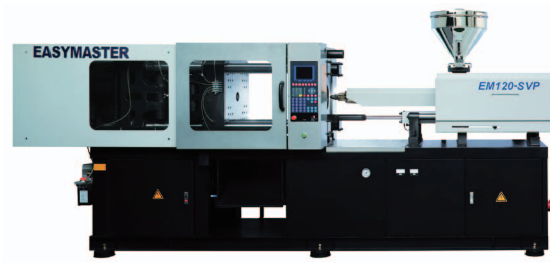
易霸伺服驅動節能注塑機 EASYMASTER Energy Saving Servo Drive Machine

Financially weaker small and medium-sized companies (SME's) are the prime victims of the financial tsunami. From the start, many banks had focused on SME's to tighten credit, breaking those companies' liquidity life-line and generally made it extremely difficult for them to continue operations. According to market intelligence, in Guangdong province alone over 10,000 SME's went out of business after October 2008 – this trend was particularly pronounced for the toys and electrical appliances export processing sectors. Similarly, export processing companies and automotive component suppliers in the cities of Shanghai, Kunshan and Suzhou in Eastern China were dealt an equally hefty blow, with orders in the electronics export sector (dominated by Taiwanese funded companies) experiencing a sharp decline. These industry sectors had all been the Group's core markets, which was the main reason why the Group immediately sensed danger in market conditions during the second half of the financial year.