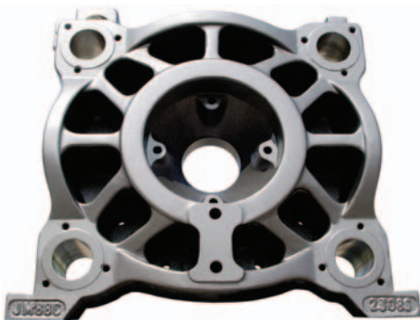
獨創專利圓形模板 Exclusive Patented Circular Platen