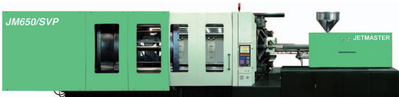
捷霸伺服驅動節能大型注塑機 JETMASTER Energy Saving Servo Drive Large Machine

The Group launched a number of new products during the last Chinaplas 2009 exhibition show which were met with favourable market acceptance. Among those exhibited included the JM650-SVP large-tonnage injection moulding machine with servo-drive and up to 70%+ energy-saving capability. Many customers who came and saw this new product were lured by its superior operating cost dynamics to consider replacing their existing old machines, and thus turned into new orders after the show. The SM250-TS In-Mould Labelling system developed by the Group's Taiwan subsidiary was a fully-automatic packaging production line for plastic containers with running speed less than three seconds per dry cycle – a perfect one-stop solution for customers requiring high-speed manufacturing of packaging containers. The newly launched SM-50P All-Electric injection moulding machine is a stunner in looks as well as superb performance, suitable for demanding customer segments in Europe and North America. It will become the Group's primary high-end product offering for the international markets when they recover in the future. The launch of these new products amid such economic turmoil further indicated that R&D is still one of the Group's core competitive advantages.