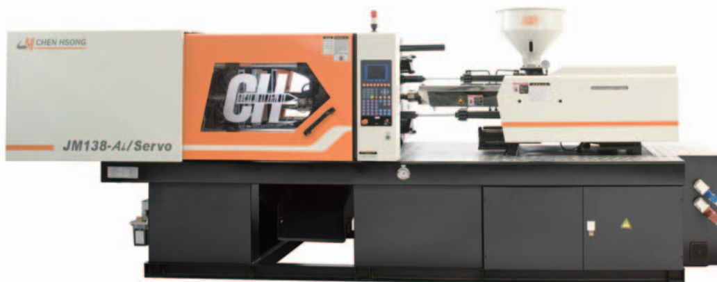
捷霸智能伺服驅動節能注塑機 JETMASTER Energy Saving Ai Servo Drive Machine

Many countries introduced emergency economic measures in response to the global financial tsunami. Latest published economic data indicated that the magnitude of economic recession has subsided. However, many uncertainties still exist, such as persistently high unemployment in many countries, weak commodity prices, ballooning government fiscal deficits, fluctuating currency exchange rates etc.. A consensus among economists and financiers appears to be that 2009 will remain challenging, while the most optimistic estimate of a global recovery will not happen until 2010.