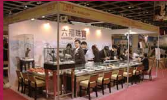
▲ Participated in exhibition activities including "Hong Kong International Wedding Trade Fair 2008" and "Hong Kong International Wedding Trade Fair 2009" held in Hong Kong Convention and Exhibition Centre in November 2008 and March 2009 respectively

參與展覽活動，包括分別於2008年11月及2009年3月於香港會議展覽中心舉行的「香港婚紗暨結婚服務博覽2008」及「香港婚紗暨結婚服務博覽2009」