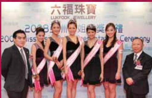
Being the exclusive sponsor for the winners' jewellery pieces in "Miss Asia Pageant" for several years ▲