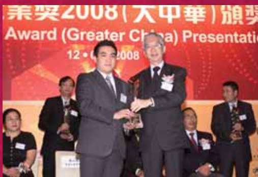
▲ "The Best Brand Enterprise Award (Greater China)" for 3 consecutive years

參與展覽活動，包括分別於2008年11月及2009年3月於香港會議展覽中心舉行的「香港婚紗暨結婚服務博覽2008」及「香港婚紗暨結婚服務博覽2009」