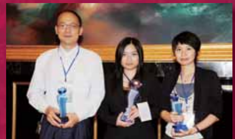
▲ Obtained 4 awards in Worldmart Panyu International Colored Gems Design Competition