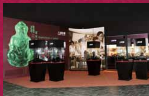
▲ Invited by the Leisure and Cultural Services Department to join the "Hong Kong Design Series 6: Jewellery for Life" exhibition