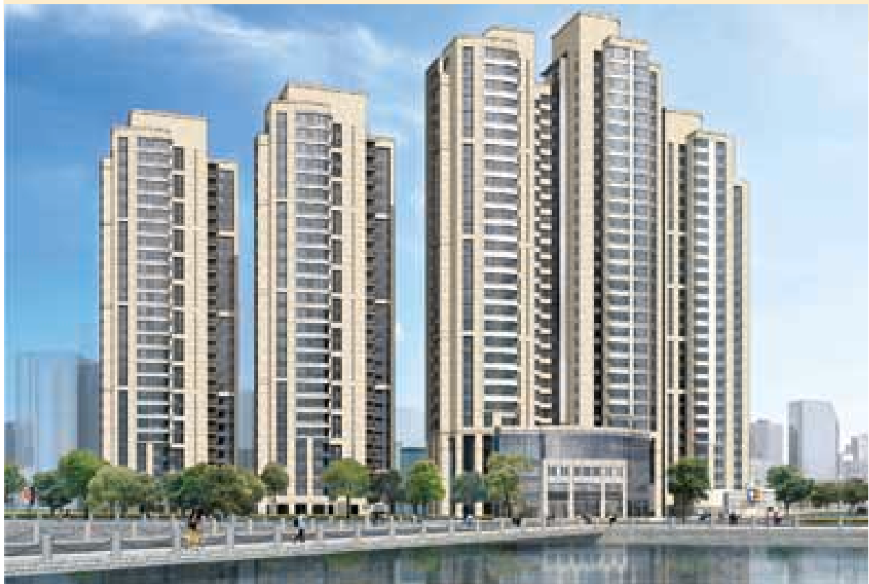
泰悦豪庭 The Riverside

The Group launched the pre-sale of 2 towers of The Riverside, a downtown residential development along the Haihe river in Tianjin, comprises 6 blocks of 30-storey towers with a total GFA of approximately 75,000 sqm, in December 2010. Against a backdrop of cooling measures and restrictions, the response of the pre-sale was satisfactory. The revenues and profits of the pre-sale will be recorded in the financial year ending 31 March 2013.