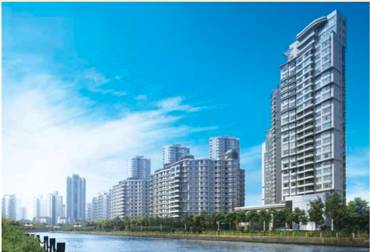
泰欣嘉園 The Waterfront

For the year under review, the Group's residential project in Shanghai, The Waterfront, recognized HK$691 million as revenues while contribution to profit amounted to HK$415 million as compared to revenues of HK$1.05 billion and profit of HK$589 million last year. The improved margin was mainly due to the increase in selling price as a reflection of market recognition of the project. Based on the latest selling price of the project, the remaining unsold area of the development is estimated to be worth over HK$1.5 billion. The recent tightening measures of the government did affect the overall transaction volume in the market but for quality projects, the price remains unyielding.