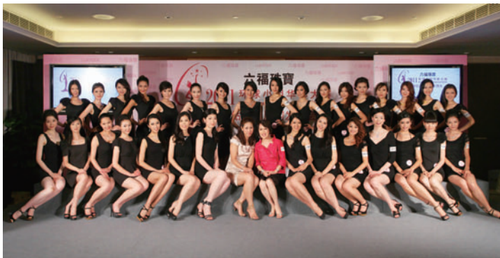
▲ Being the exclusive sponsor of the crown of "2011 Miss Universe China Reignwood Pageant" 獲邀成為國內「2011 環球小姐華彬大賽」金鑽后冠獨家贊助商

▶ Sponsored the diamond crown and precious jewellery pieces to "Miss Hong Kong Pageant" for the 14th consecutive year 連續十四年贊助「香港小姐競選」金鑽后冠及名貴珠寶首飾