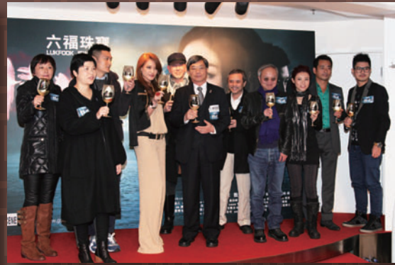
▲ Sponsored product and filming location for the movie "The Second Woman" starring famous movie stars Ms. Shu Qi and Mr. Shawn Yue. The Gala Premiere title sponsored by the Group in Hong Kong, with the presence of the two main casts, gave Lukfook VIP members a memorable night. 贊助由影視巨星舒淇小姐及余文樂先生主演的電影《情謎》，除了於分店拍攝取景及產品植入外，更冠名贊助香港的首映禮，與一眾六福 VIP 會員先睹為快。