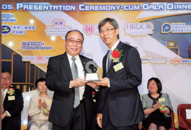
◀ "2011 Hong Kong Awards for Industries: Customer Service Award" from Hong Kong Retail Management Association 榮獲香港零售管理協會「2011 香港工商業獎：顧客服務獎」