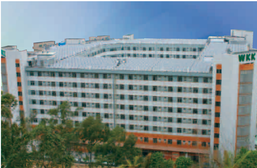
Worker dormitory, Dongguan 工人宿舍，東莞

WKK Technology Limited is the pioneer in green manufacturing. Since 2002, over 1,600 solar panels were installed on the roof of worker dormitory in WKK Technology Park at Dongguan China for 24 hours hot water supplies to our 5,000 employees. 王氏港建科技有限公司是綠色製造業之先鋒。自二零零二年起，於位於中國東莞王氏港建科技城之工人宿舍屋頂上，安裝超過1,600塊太陽能電池板，以供應24小時熱水給我們5,000名員工。