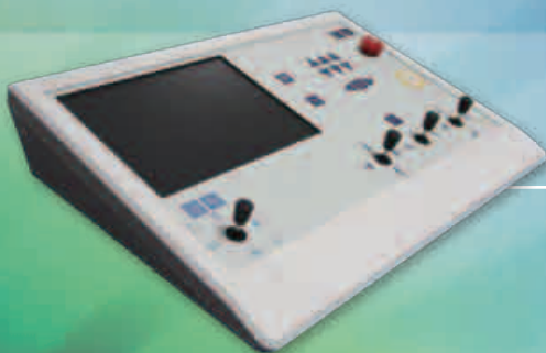
Medical X-Ray equipment control panel 醫療X光機控制面板