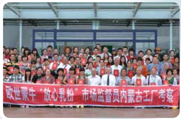
Market inspectors for MENCHIU ARLA (歐世蒙牛) "Trustworthy Milk Powder" (放心乳粉) visited the production base in Inner Mongolia