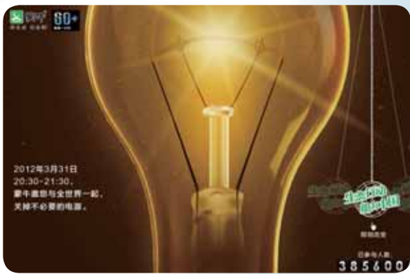
Participated in the "Earth Hour" (地球一小時) activity 參與「地球一小時」熄燈活動

蒙牛在年內對質量安全管理體系投入了大量的資源，包括聘請國際快消品行業品質管控專家、在各運營環節增加品質檢測人員及設備、加強員工質量檢驗技能的培訓等，全面提升蒙牛的質量管理水平。