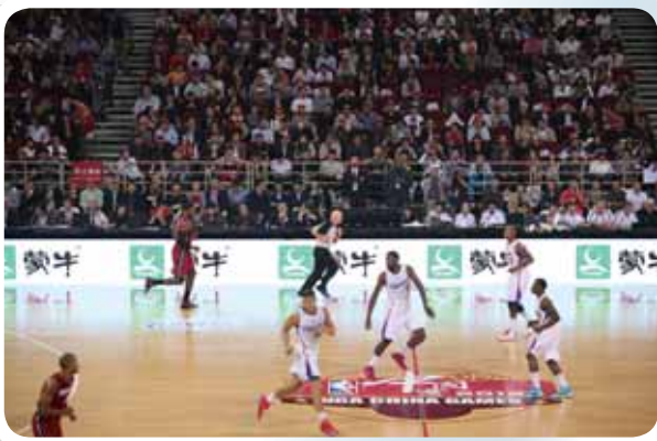
Created the "Happy Hours for Basketball Fans" (球迷幸福時刻) at the sixth NBA China Games

乳製品行業方面，國家及社會繼續通過加強監管及媒體監督等方式促進行業規範化發展。在外部環境和消費需求的共同推動下，乳製品行業銷售額保持穩定增長。同時，因應消費者對高端乳製品需求不斷增加的趨勢，行業內部產品結構進一步升級，高價位、高附加值的產品逐漸獲得市場青睞，增速加快。然而，受物價水平持續上漲影響，牧場飼養成本增長較快，使原奶價格亦相應上漲。