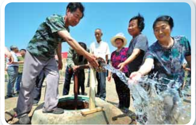
Continued to build the "Charity Well" (愛心井) 持續建設「愛心井」