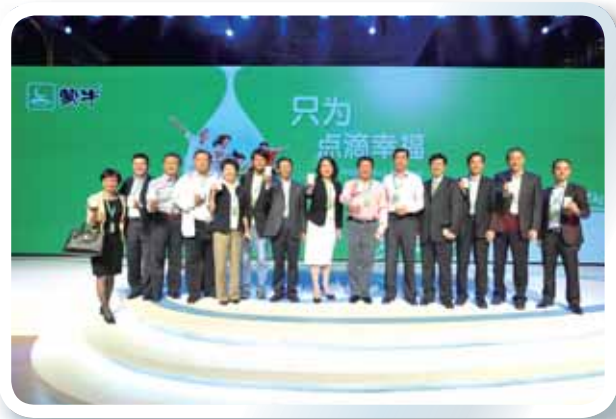
Launched the new brand image “A Little Happiness Matters”