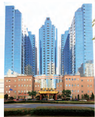
TOMSON BUSINESS CENTRE 湯臣商務中心大廈