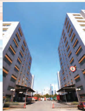
TOMSON WAIGAOQIAO INDUSTRIAL PARK 湯臣外高橋工業園區