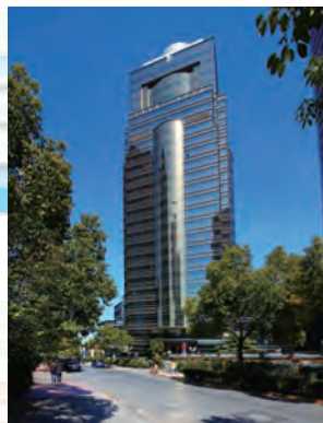
TOMSON COMMERCIAL BUILDING 湯臣金融大廈