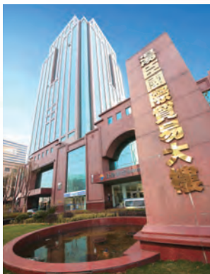
TOMSON INTERNATIONAL TRADE BUILDING 湯臣國際貿易大樓