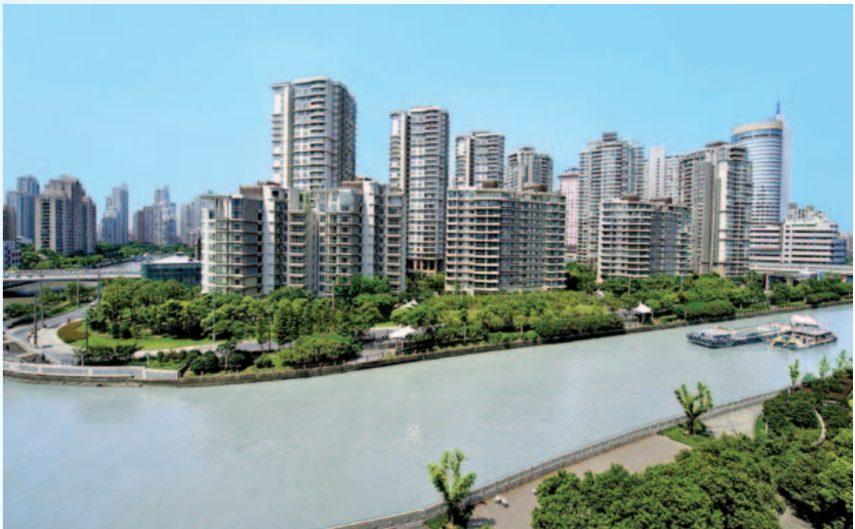
泰欣嘉園 The Waterfront