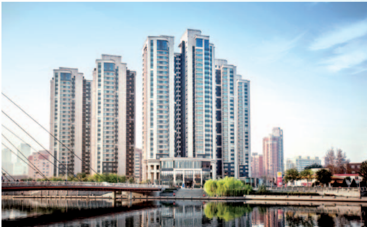
泰悦豪庭 The Riverside