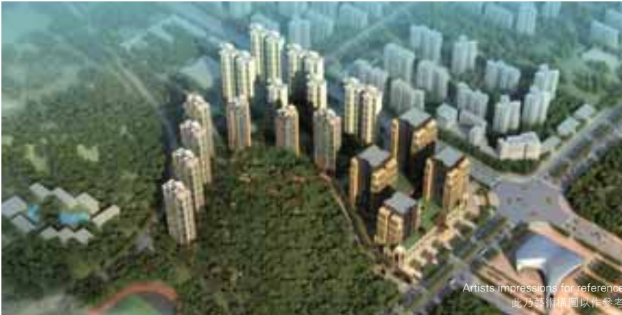
Artists impressions for reference 此乃藝術構圖以作參考