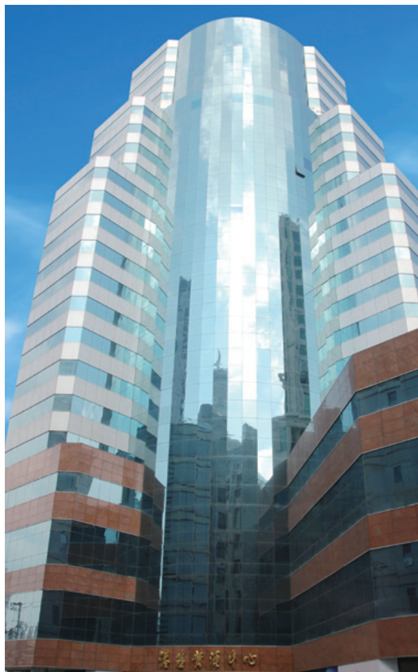
Harbour Ring Huangpu Centre, Shanghai