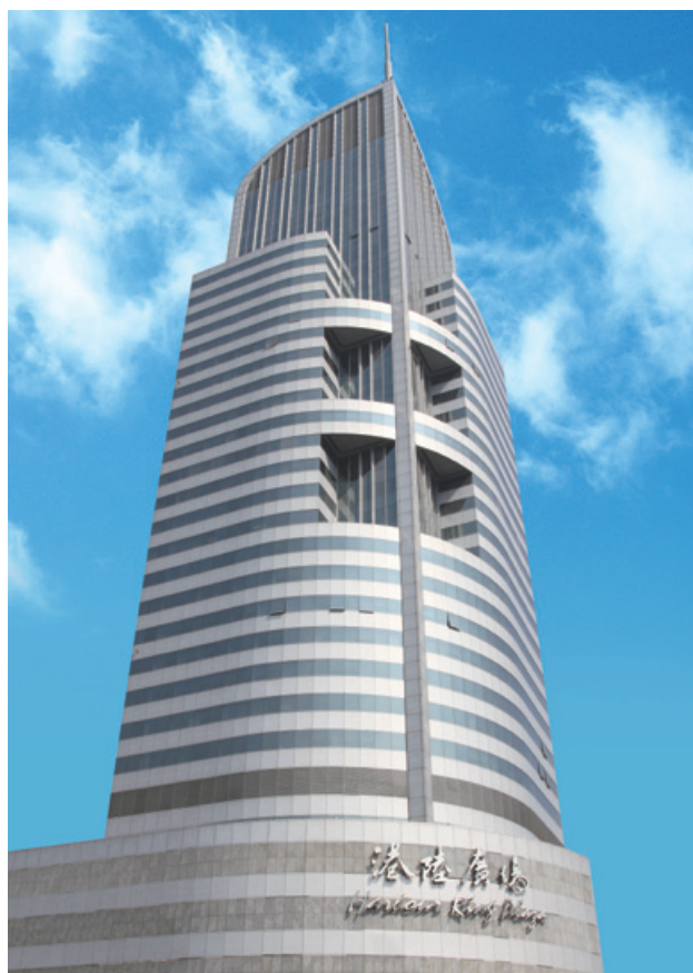
Harbour Ring Plaza, Shanghai

Revenue for the year amounted to HK$88.4 million (2012: HK$87.8 million) and earnings before interest expense and tax ("EBIT") for the year was HK$199.7 million (2012: HK$208.8 million). Excluding the write back of provisions and others relating to the disposed subsidiaries in prior years of HK$50.4 million (2012: HK$71.2 million), the recurring EBIT for the year increased by 8% from HK$137.6 million in 2012 to HK$149.3 million in 2013. The increase in recurring EBIT was mainly attributable to the increase in interest income during the year.