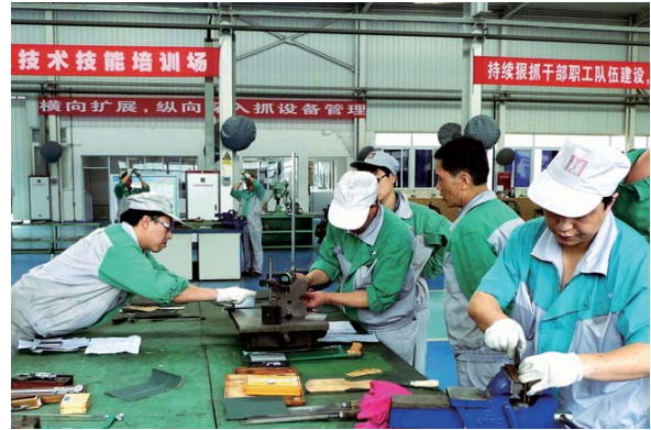
高技能人員實作培訓 Practical training for the staff with high professional qualification

影響小的「民生關聯客戶」；抓住下半年各地加快執行「國四」排放標準的機遇，發揮慶鈴「國四」產品的技術與性價比優勢，加大力度奪取競保客戶。經努力，2013年銷售呈前低後高走勢，四季度較三季度增長約20%，高於商用卡車行業同期增幅；且這一勢頭在今年1月得到延續。