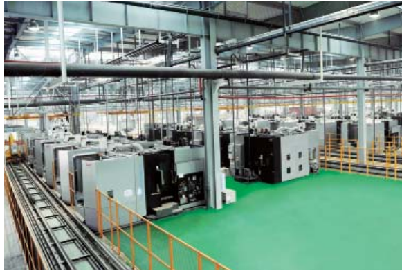
重型發動機生產線 The production line of heavy-duty engines