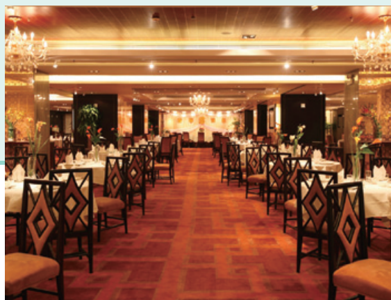
Shenzhen Carrianna Friendship Square Restaurant 深圳佳寧娜友誼廣場大酒樓

年內，面對酒店及餐飲行業的困難經營環境，管理層作出各種開源節流措施，改善酒店及酒樓業務的經營效益。