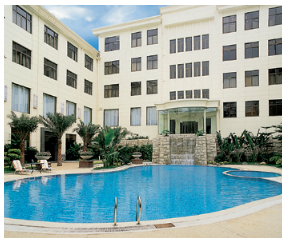
Foshan Carrianna Hotel 佛山佳寧娜大酒店

During the year, management installed various measures to increase revenue and control cost so as to improve operating results of the hotel and restaurant business.