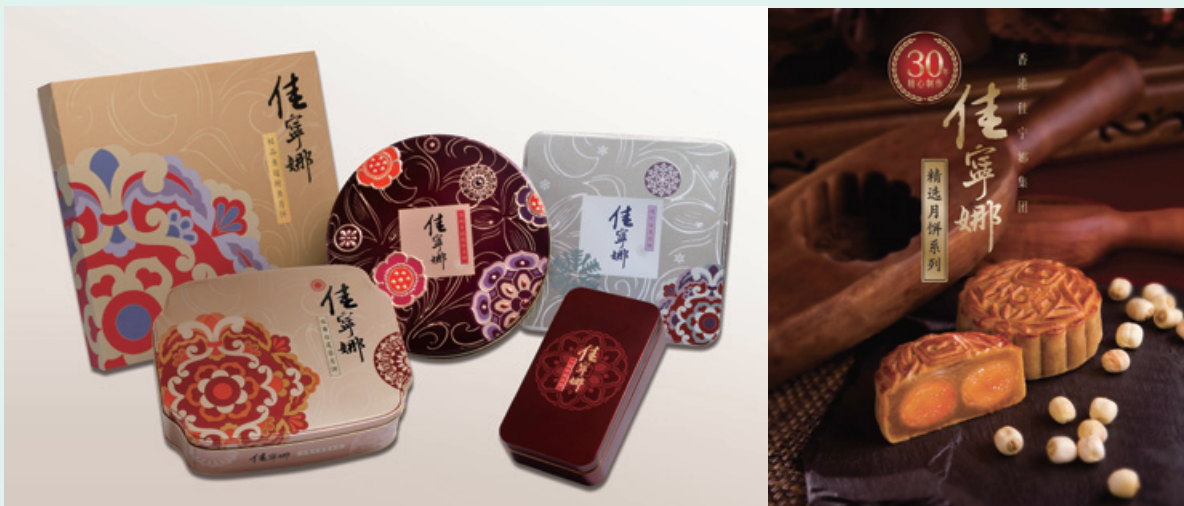
Carrianna moon cake products 佳寧娜月餅系列