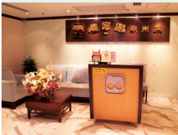
Carrianna Restaurant at Wanchai, Hong Kong 香港灣仔佳寧娜酒樓