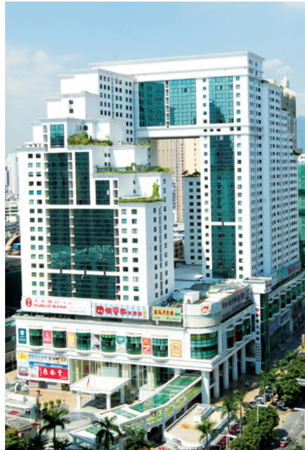
Carrianna Friendship Square 佳寧娜友誼廣場

For investment properties, rental income for the year was significantly increased by 22% from last year. The main reason for rental income increase was the satisfactory rental increment as well as occupancy rate improvement from 97% to 99% of Carrianna Friendship Square in Shenzhen. The rental income from properties in Hong Kong, Hunan and Jiangsu also recorded satisfactory growth.