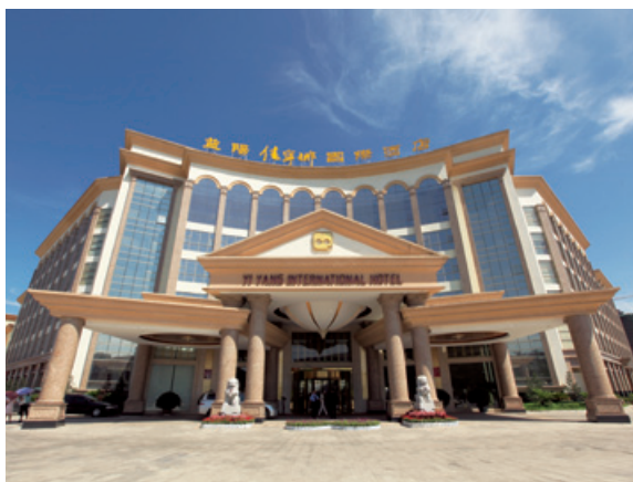
Yiyang Carrianna International Hotel 益陽佳寧娜國際大酒店