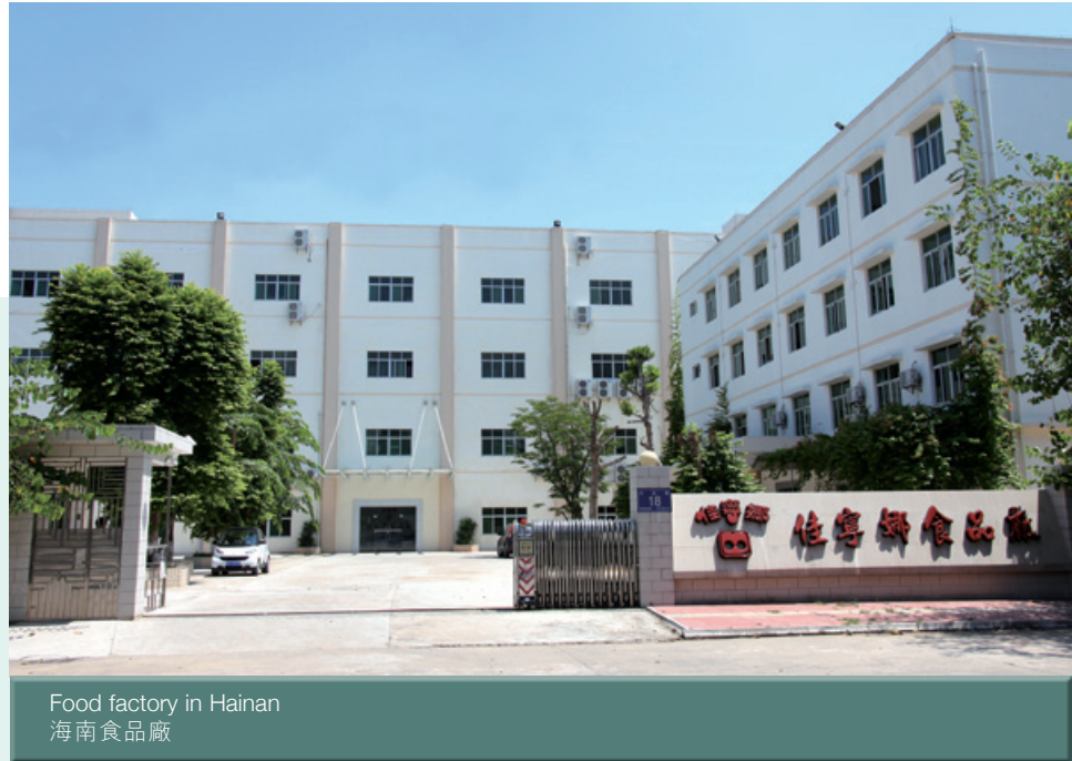
Food factory in Hainan 海南食品廠

Turnover and operating profit for mooncake sales continued to grow satisfactory 月餅銷售額及經營溢利均錄得理想增幅