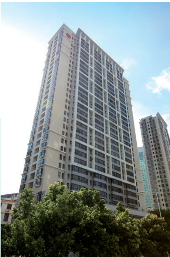
Imperial Palace 駿庭名園