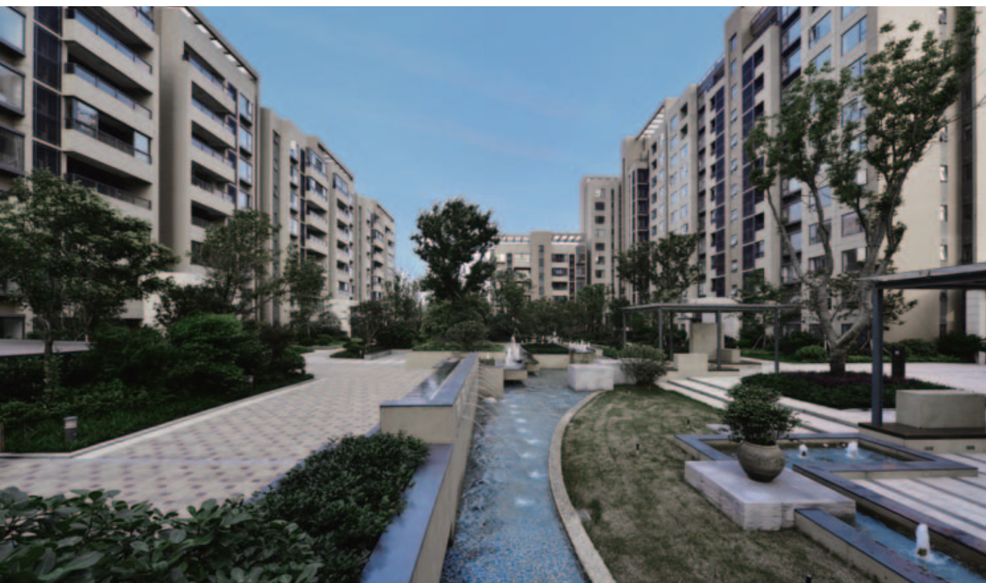
Wuhan Tiandi creates a comfortable living environment