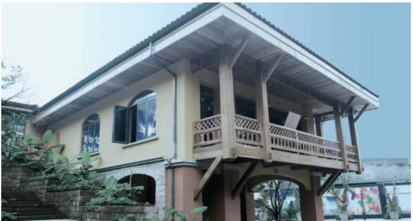
The traditional stilted architecture is blended in Chongqing Tiandi

potential. Some cities with a hollow economic base will lose population and experience a slowdown in real estate investment. Those cities that are able to establish a robust economic base and diversify beyond manufacturing to build a strong tertiary sector should create increased employment, attract population inflow and witness land value appreciation. The cities in which Shui On has invested, namely, Shanghai, Chongqing, Wuhan, Foshan and Dalian, are all in a strong position to see rising competitiveness and good opportunities for quality economic growth and development. Going forward, our business development efforts will be focused on cities that attract talent and capital and have excellent potential for growth and value creation.