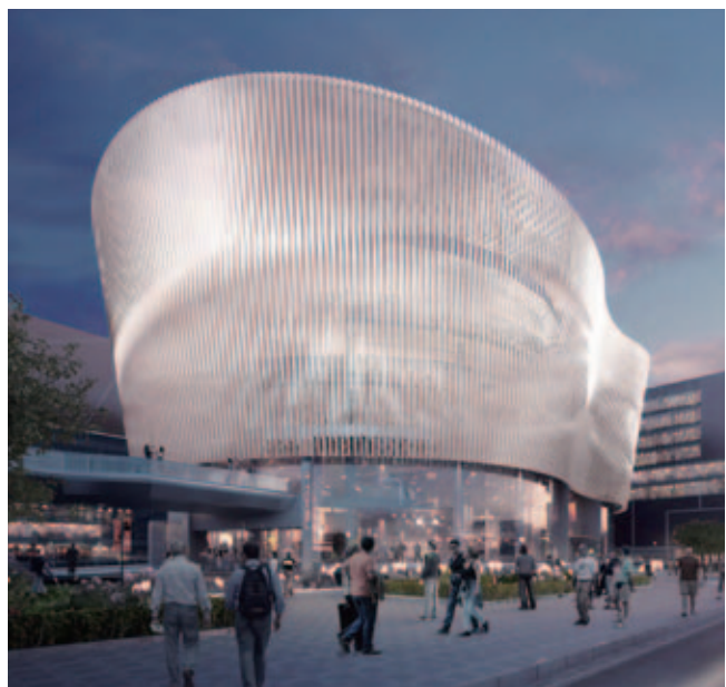
THE HUB Performance Centre is designed as a multi-functional platform for a variety of conferences, events and performances