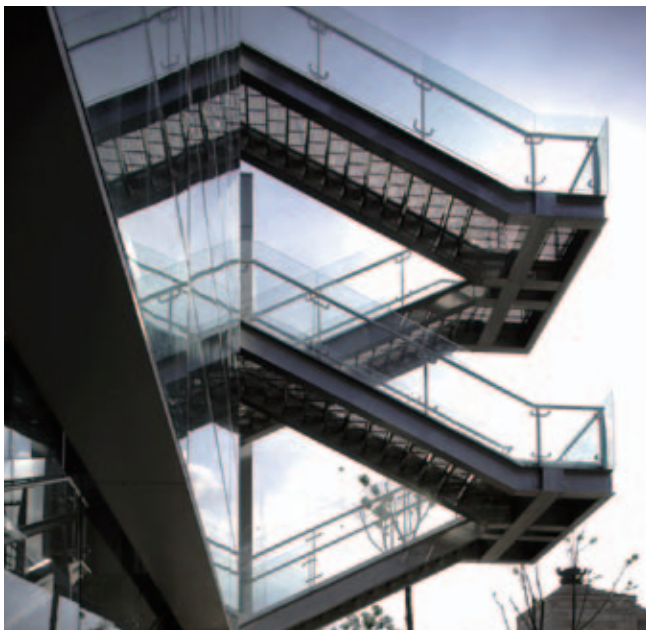
KIC creates an environment to foster entrepreneurship and technology innovation

1 A total of 6,000 sq.m. of leasable GFA at Shanghai KIC was occupied as offices by the Group.