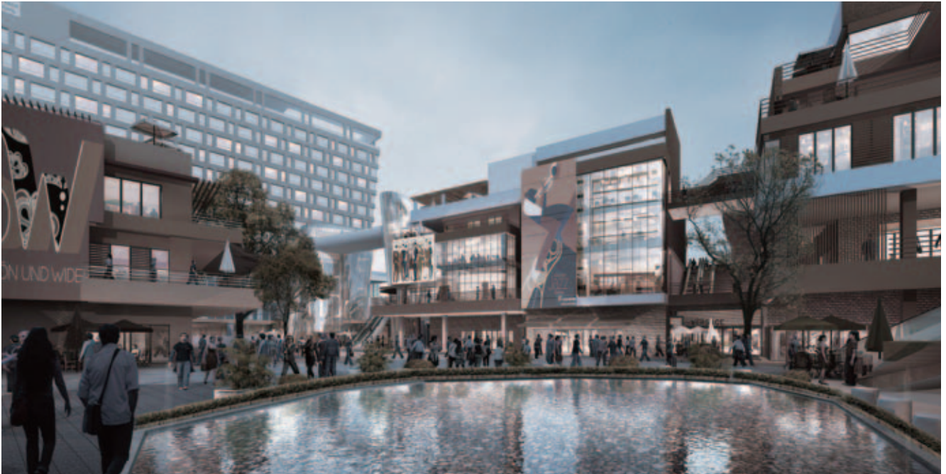
THE HUB Xintiandi will comprise of delicacy and recreational facilities

The table below provides an overview of newly completed commercial properties and commercial properties under development in the Shui On Land Portfolio as of 30 June 2014: