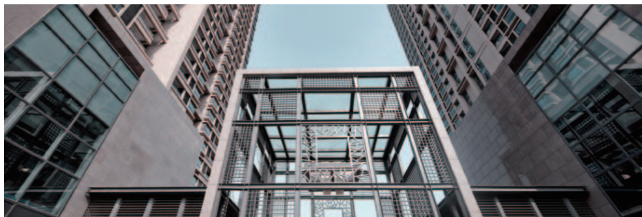
Rui Hong Xin Cheng becomes an icon of modern city lifestyle

Relocation is underway on a total leasable and saleable GFA of 861,000 sq.m., as described in the previous section. Relocations at these sites are planned for completion between 2014 and 2015. Relocation plans and the timetable for the remaining 726,000 sq.m. of GFA located at Shanghai Taipingqiao and RHXC have yet to be determined. The relocation plans for these sites are subject to final proposal and agreement terms among relevant parties.