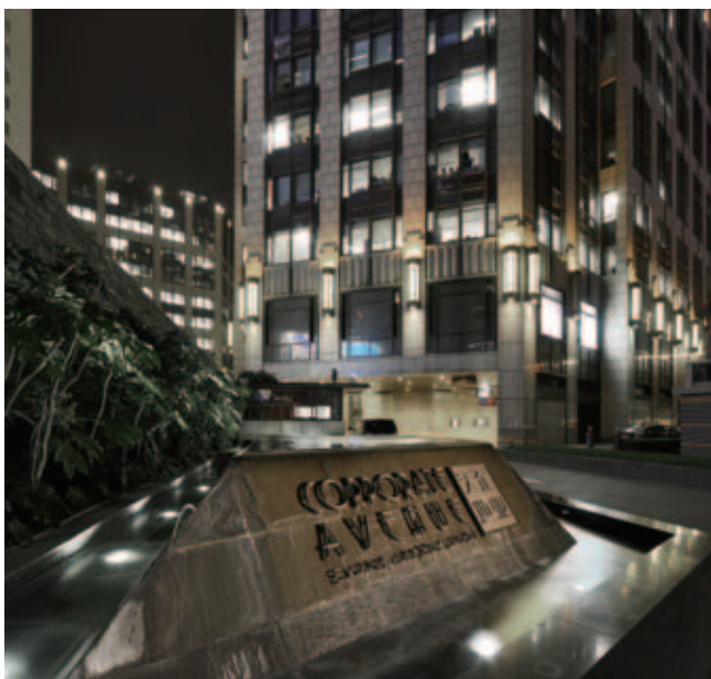
Corporate Avenue at Shanghai Taipingqiao sets a benchmark for Grade A Offices

Selling and marketing expenses decreased significantly by 28% to RMB103 million (2013: RMB143 million) mainly due to the decrease in contracted sales achieved by the Group (excluding sales by associates) by 58% to RMB2,613 million (2013: RMB6,167 million).