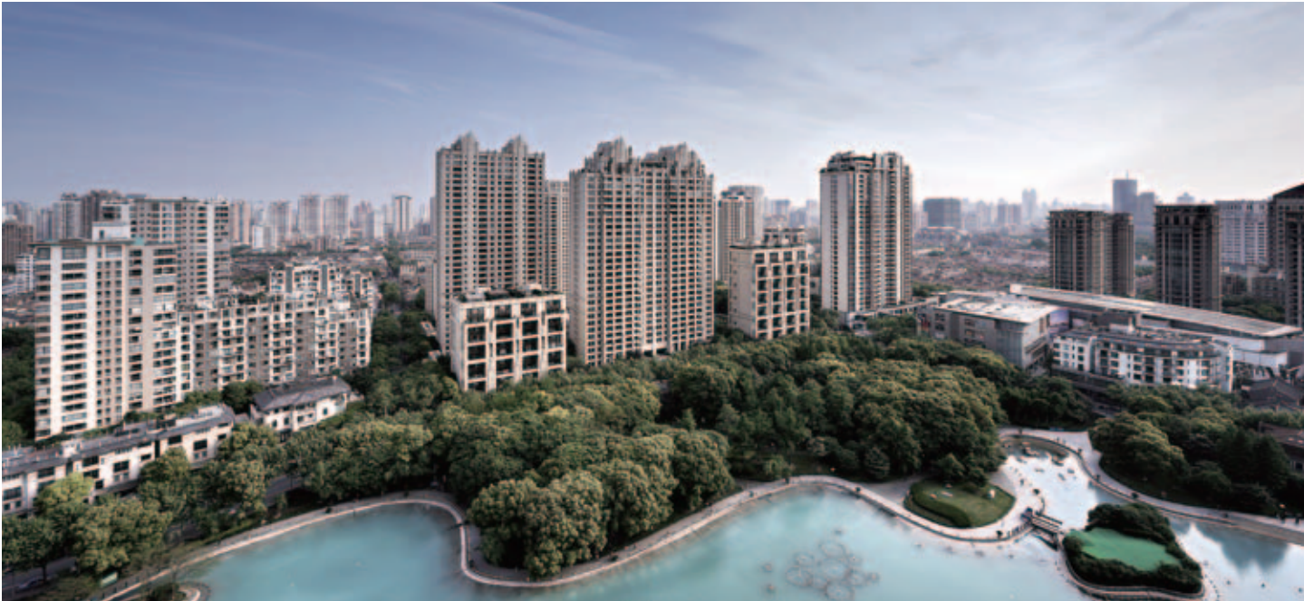
Outlook of Shanghai Taipingqiao

At Huangnichuan (Site C of Dalian Tiandi), a total GFA of 70,000 sq.m. is under construction for commercial use and 156,000 sq.m. for residential properties. They are planned for completion starting from 2015.