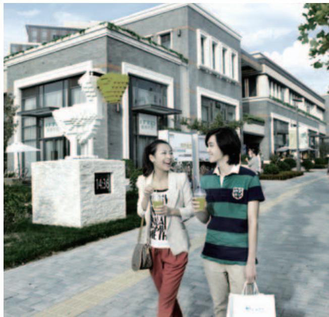
IT Tiandi at the Huang Ni Chuan Plate of Dalian Tiandi provides a Lohas and creative environment for work, life and leisure