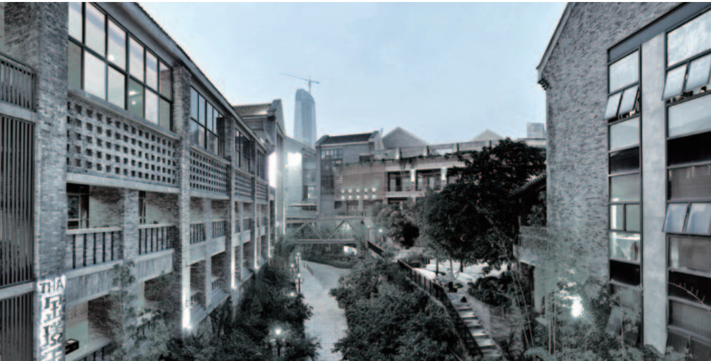
Chongqing Tiandi fully reflects the unique local architectural features of mountain buildings

Earnings per share attained RMB0.10, which is calculated based on a weighted average of approximately 8,002 million shares in issue during the six months ended 30 June 2014 (2013: RMB0.15, which is calculated based on a weighted average of approximately 6,973 million shares in issue).