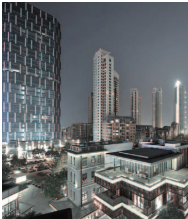
Wuhan Tiandi has matured with a mix of commercial, office and residential elements