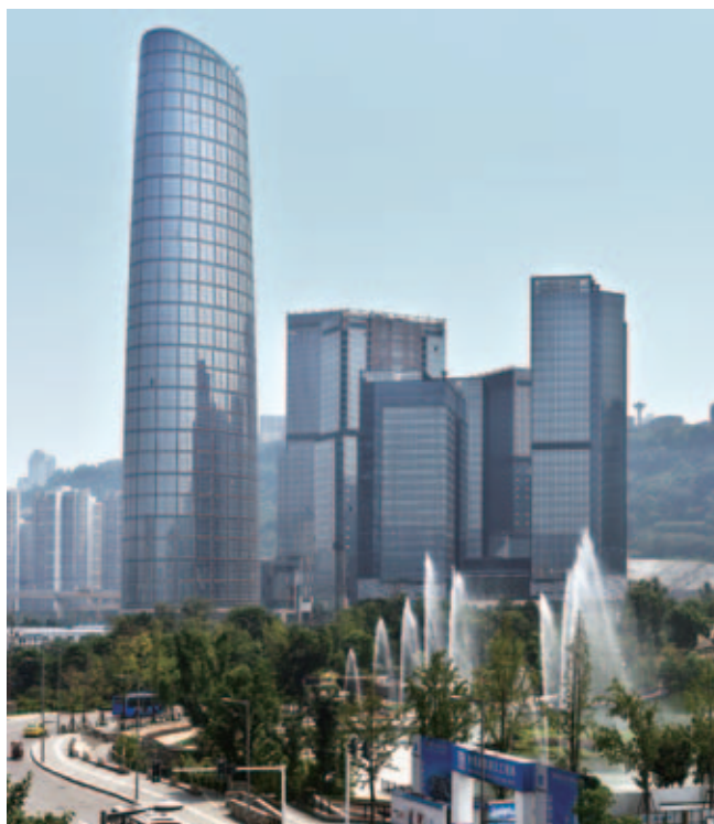
The Commercial Cluster at Chongqing Tiandi catalyses the economic prosperity of the Western China

Pre-leasing is currently underway at 3, 4 & 5 Corporate Avenue at Chongqing Tiandi, properties held by certain affiliates of Ping An Group. The office area of 2 Corporate Avenue in Chongqing Tiandi, which was sold to Sunshine Life Insurance, is yet to be delivered.