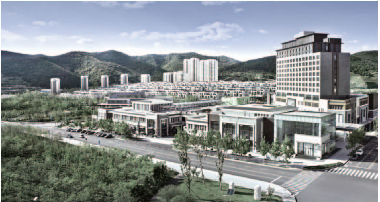
Dalian Tiandi takes full advantage of green technology to create a low-carbon green environment for living and working