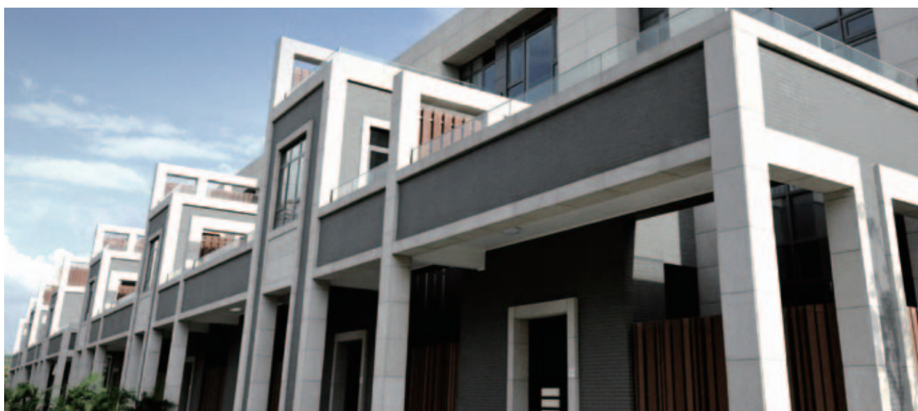
Foshan Lingnan Tiandi has become a landmark of the city and its residential products are highly recognised by the market

As of 30 June 2014, the Group had invested a total of RMB14.2 billion of capital into relocation of sites for a total GFA of 861,000 sq.m. in the Shanghai Taipingqiao project and Shanghai RHXC project. A total of 283,000 sq.m. of GFA was cleared during the past few months. The Group expects stronger sales to be generated from Shanghai from the second half of year 2015 ("2H 2015").