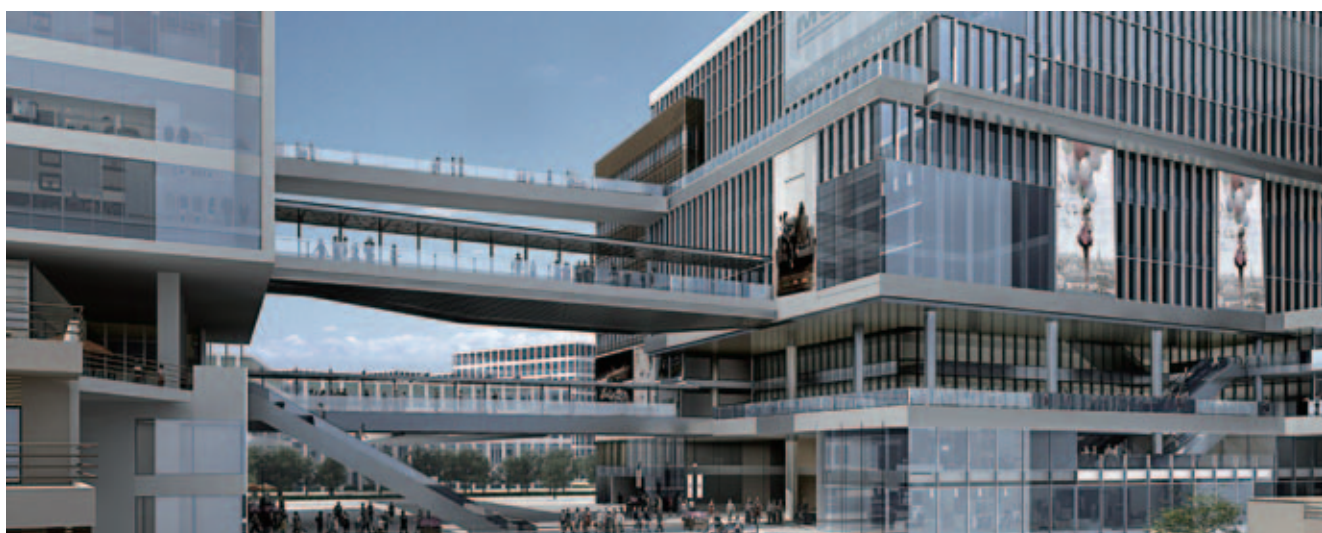
First batch of enterprises has entered THE HUB Showroom Offices to start off businesses