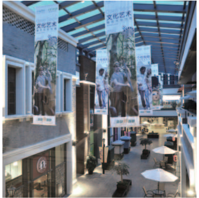
Wuhan Tiandi (left) and Dalian Tiandi (right) strive to provide a pleasant living and working environment for the local people

at fixed rates ranging from 9.57% to 9.68% per annum, based on the notional amounts of RMB1,269 million in aggregate.