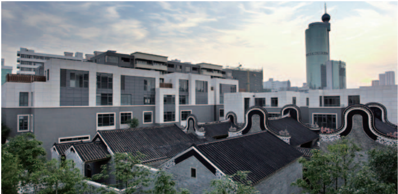
Foshan Lingnan Tiandi preserves the traditional architectures and reinvigorates them with modern elements

Shanghai is moving ahead with its ambitious plan to become an international financial and trading centre by 2020. The economy is seen to benefit from the Free Trade Zone (FTZ) pilot policy. A revised 'negative list' issued on 1 July will help to attract talent and more foreign investment into a broader spectrum of tertiary sector activities. The recently announced Shanghai-Hong Kong Stock Connect programme is a new experiment for a two-way opening of China's capital markets, which will boost cross-border stock investment between Shanghai and Hong Kong. The opening of Disneyland in 2015 will stimulate tourism and retail sales, helping to support retail rents in both primary and secondary locations. These developments should energise tertiary sector growth and attract more capital flows into Shanghai.