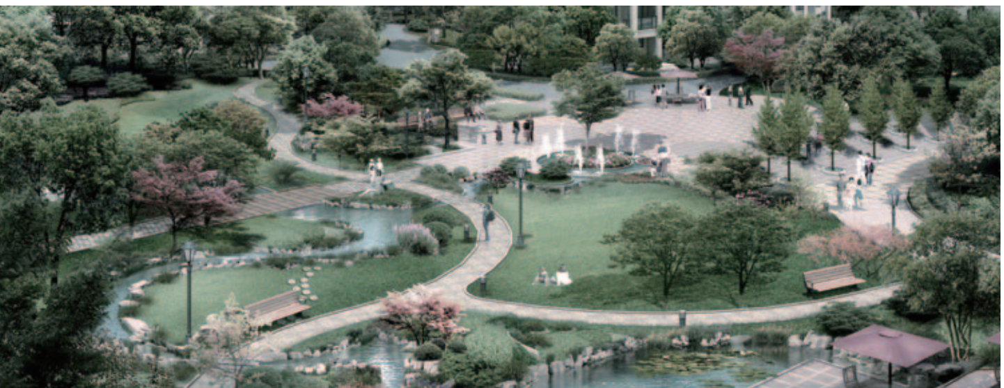
Greenview Heights of Dalian Tiandi creates a green and livable environment