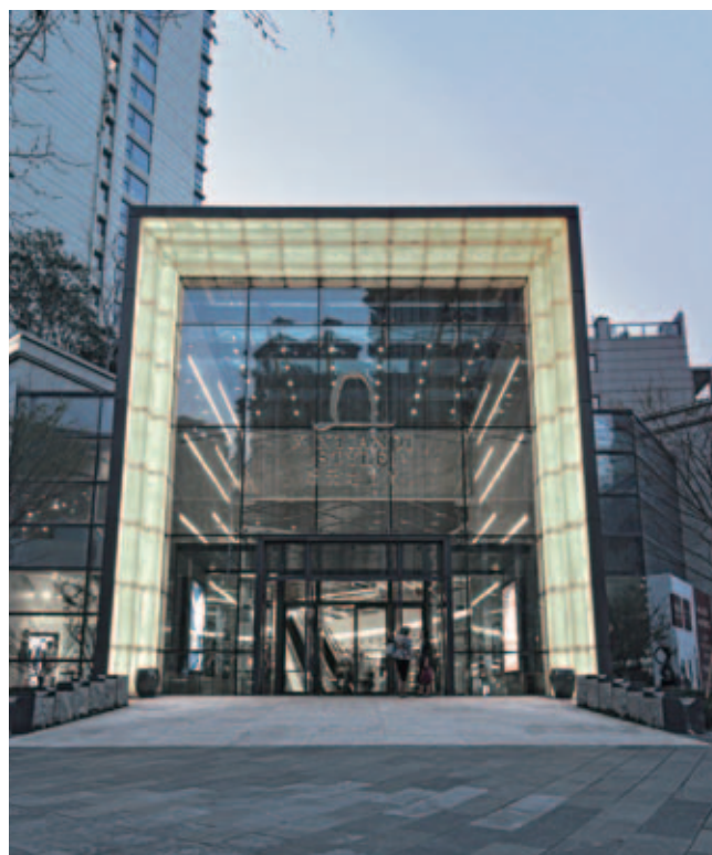
Xintiandi Style provides room for young designers to grow and develop