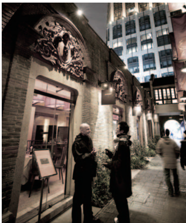
Shanghai Xintiandi, a fusion of East and West

1 A total leasable GFA of 14,000 sq.m. of the performance and exhibition centre located at THE HUB D19 was not included in this table.